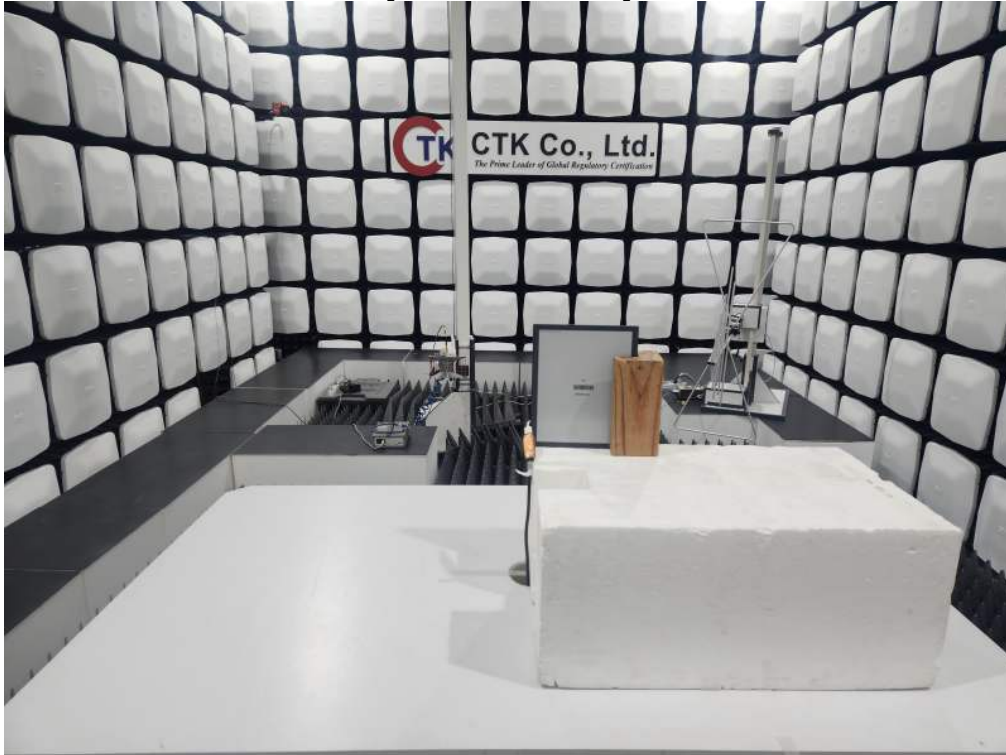
[18 GHz to 26.5 GHz]