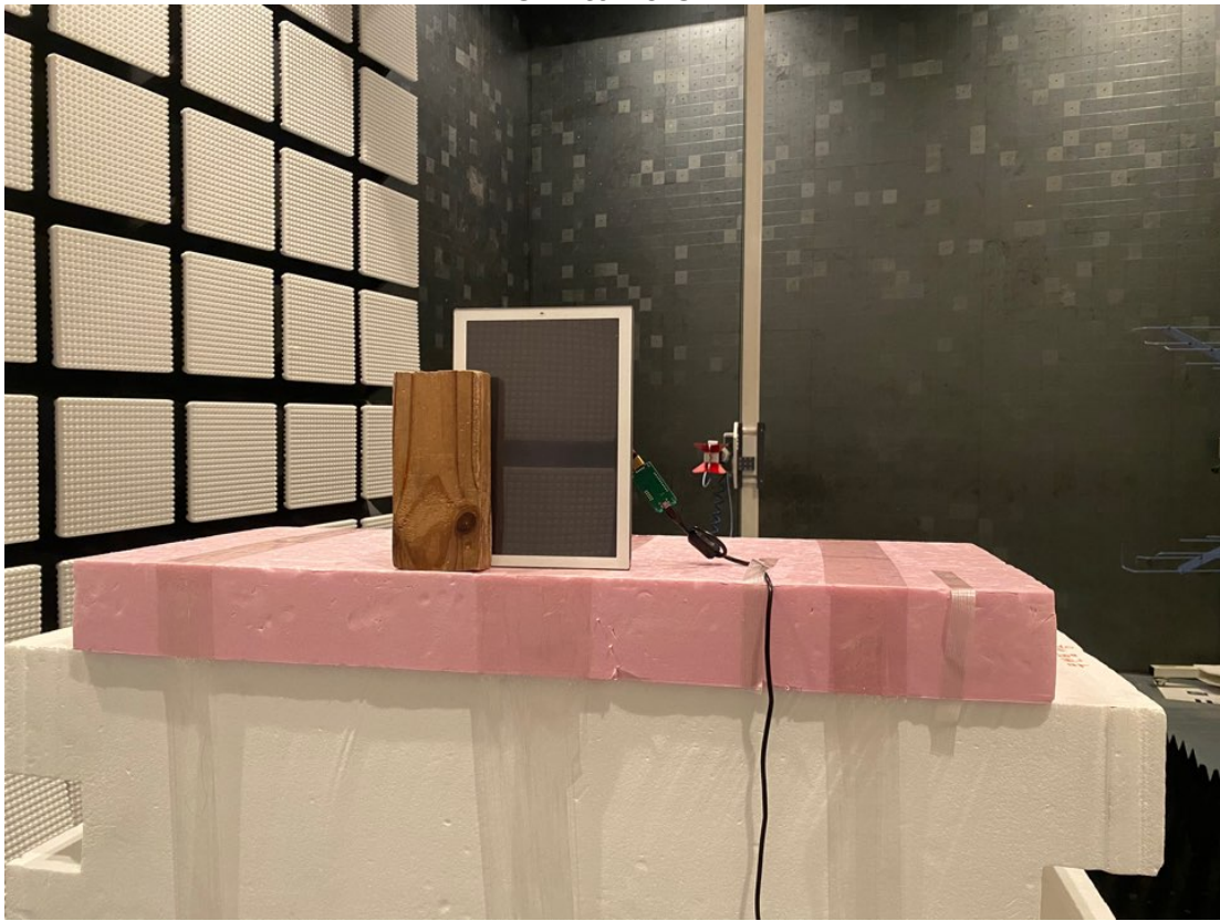
18 GHz to 26.5 GHz