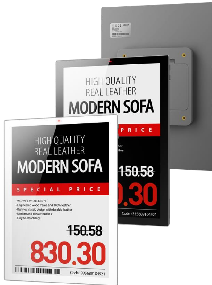
Figure 2. NEWTON S-Label