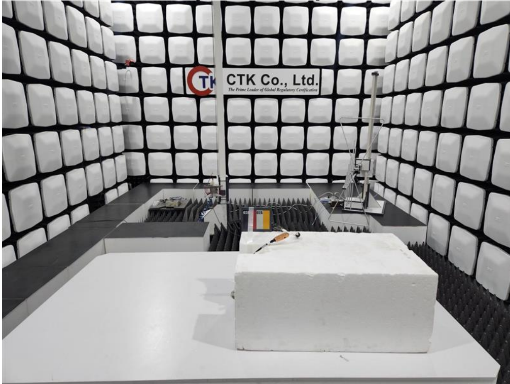
[18 GHz to 26.5 GHz]