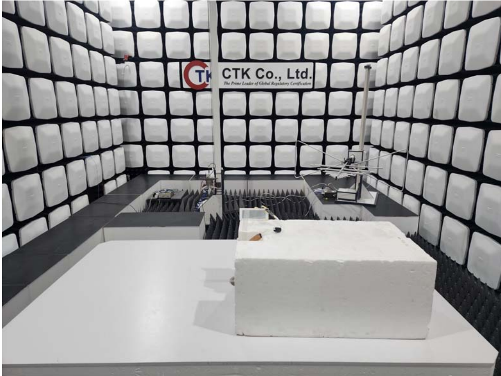
[18 GHz to 26.5 GHz]