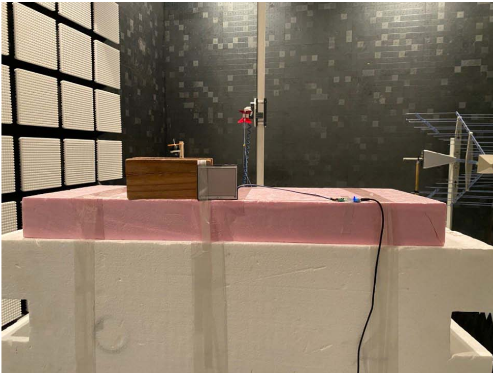
18 GHz to 26.5 GHz