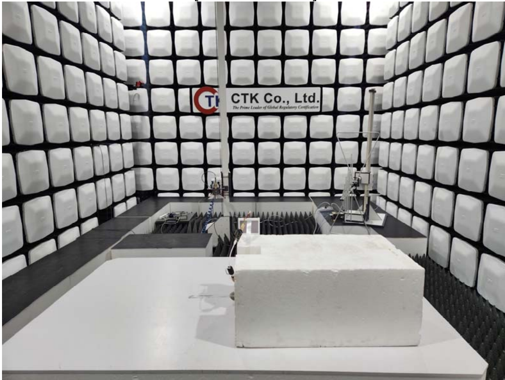
[18 GHz to 26.5 GHz]