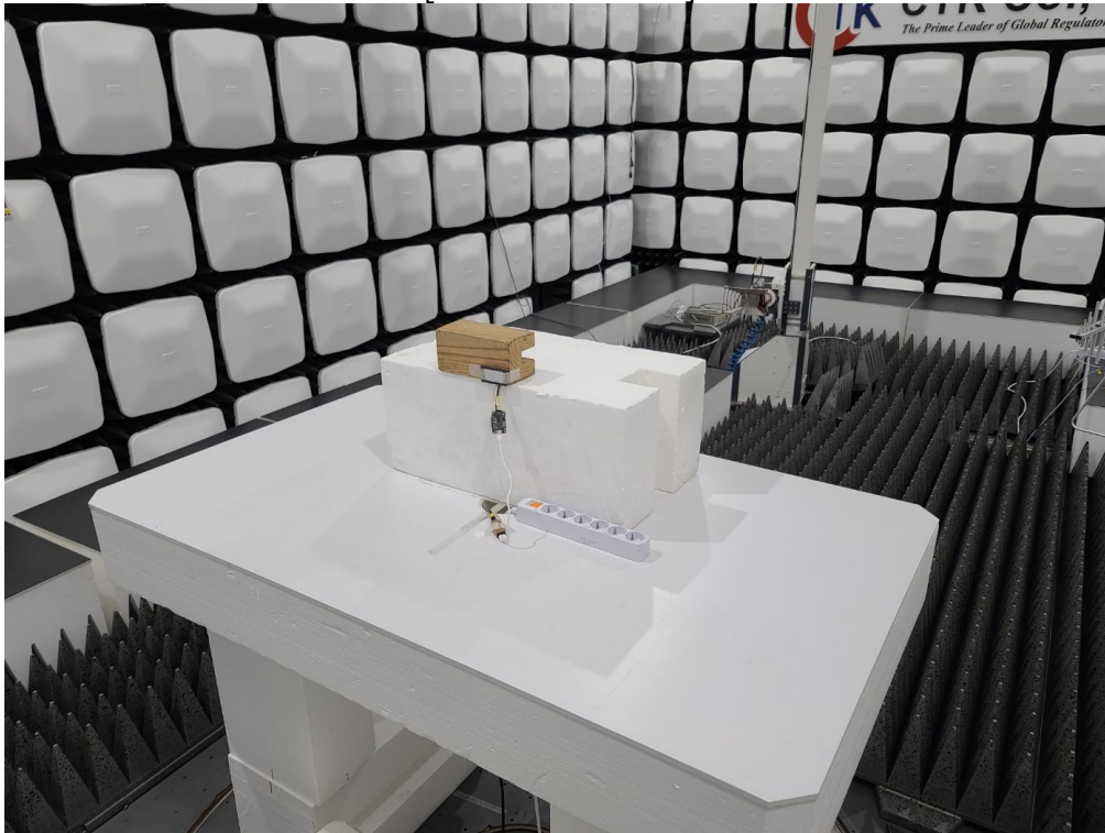
[18 GHz to 26.5 GHz]