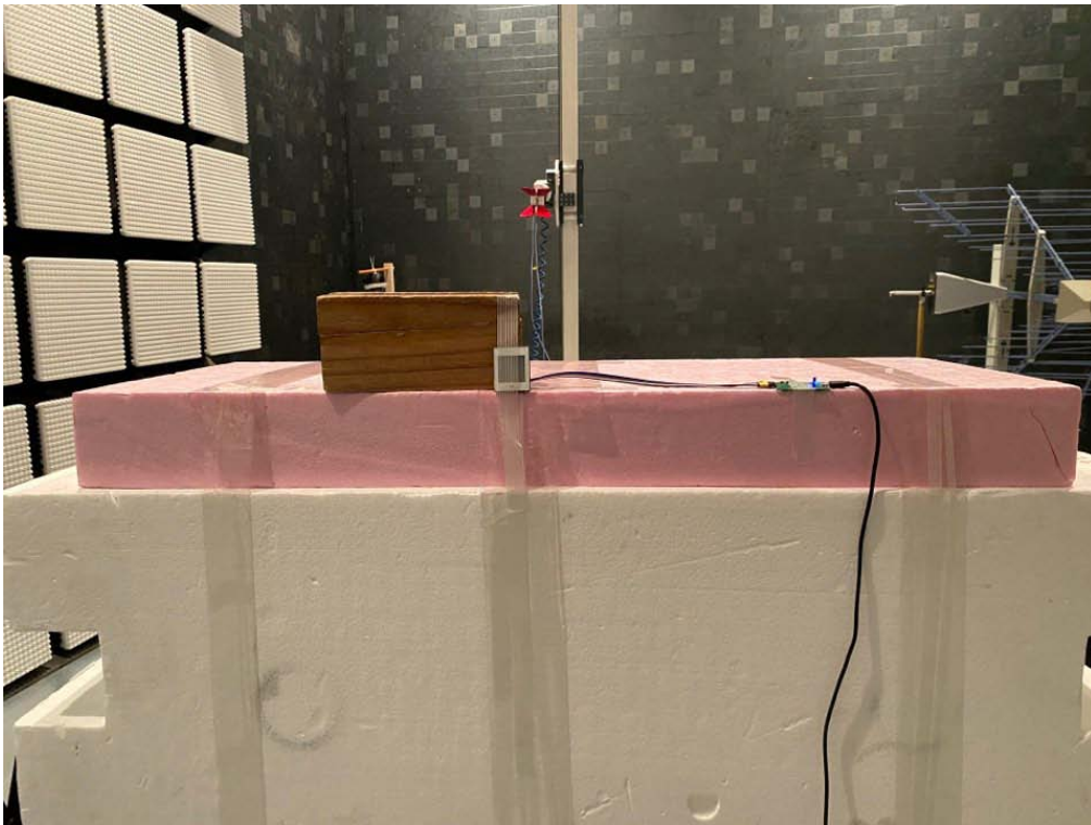
18 GHz to 26.5 GHz