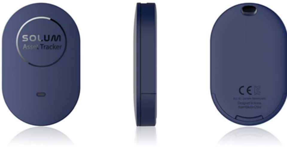
CS06BHB01D (Dark Navy)