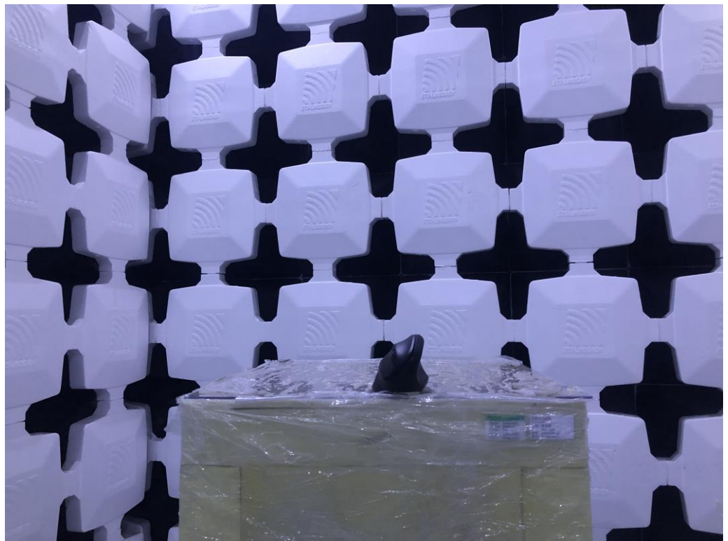
The EUT was placed at the center of turntable