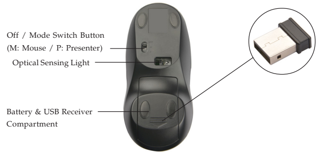
Figure 2: Multi-Task Wireless USB Presenter Mouse - rear