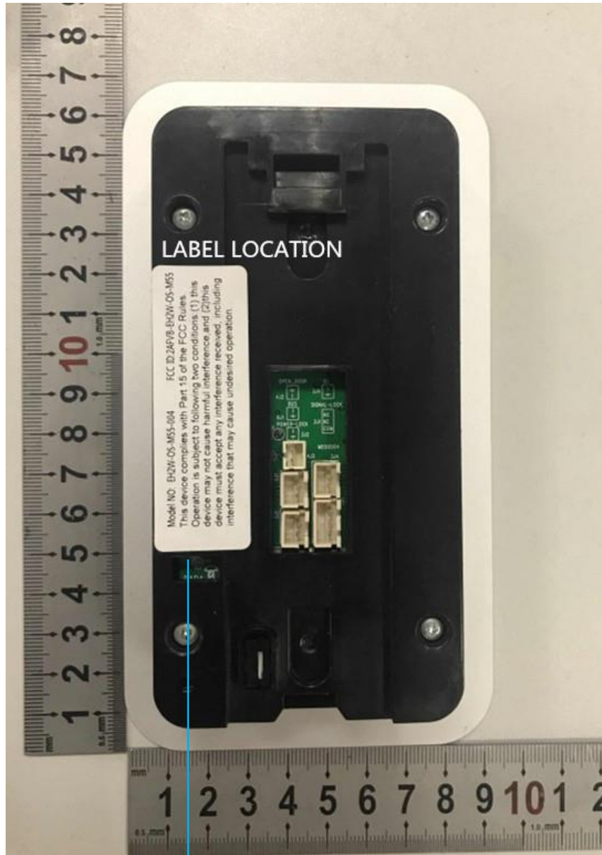
Label Size: 60mm*20mm