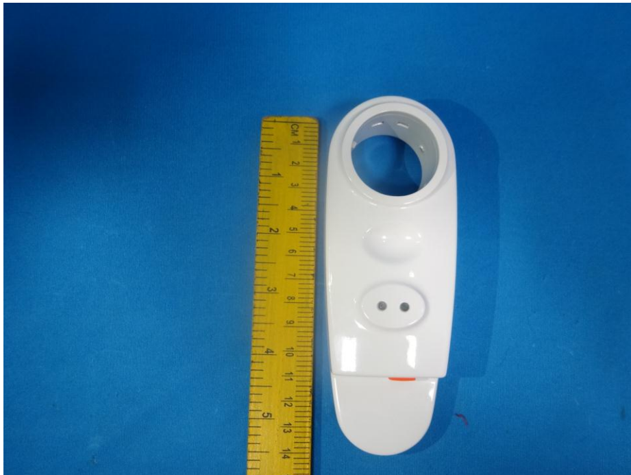
EUT Dimensional View