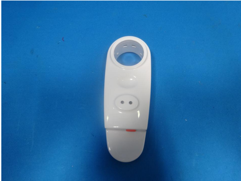
EUT Bottom View