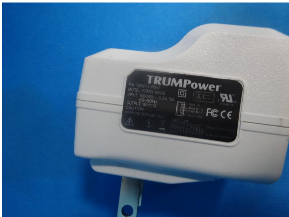
EUT Power adaptor rating label