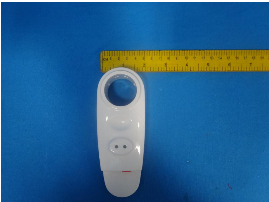
EUT Dimensional View