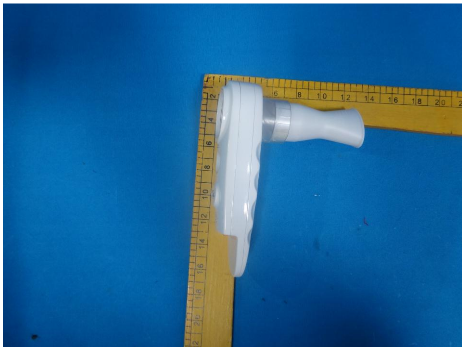
EUT Dimensional View