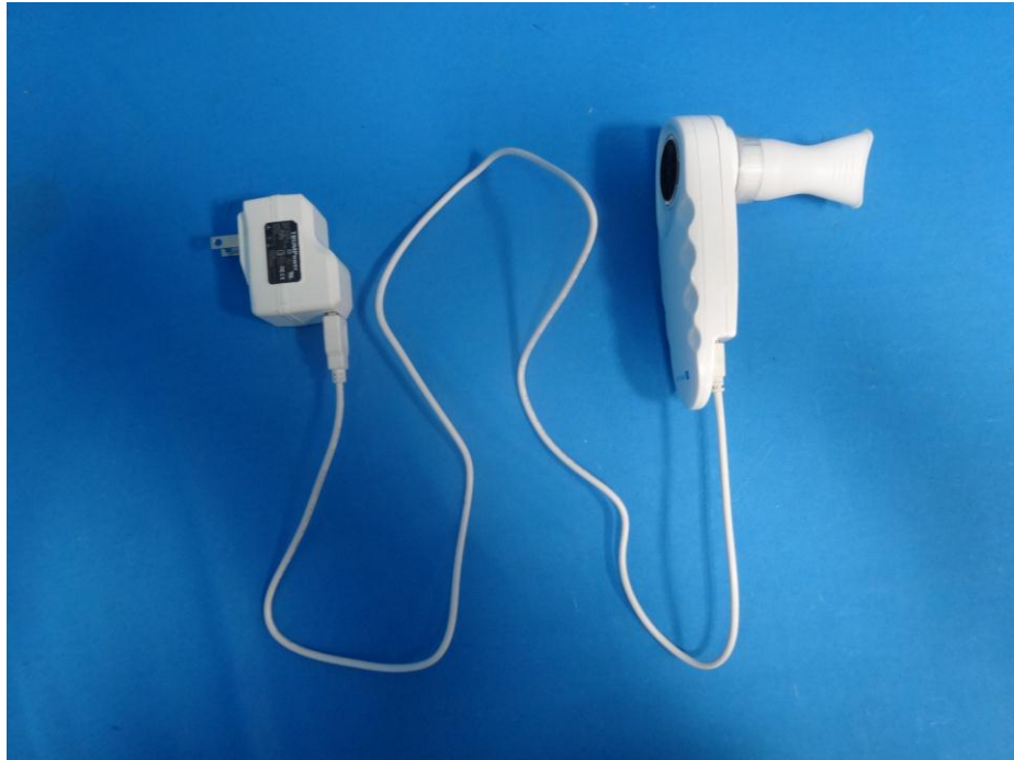
EUT with Power Adaptor