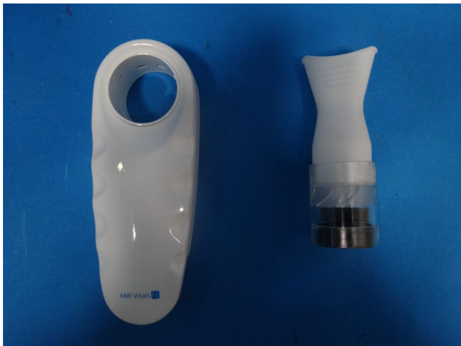
EUT Top View