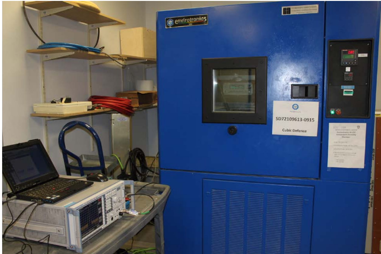
Frequency Stability Test Setup