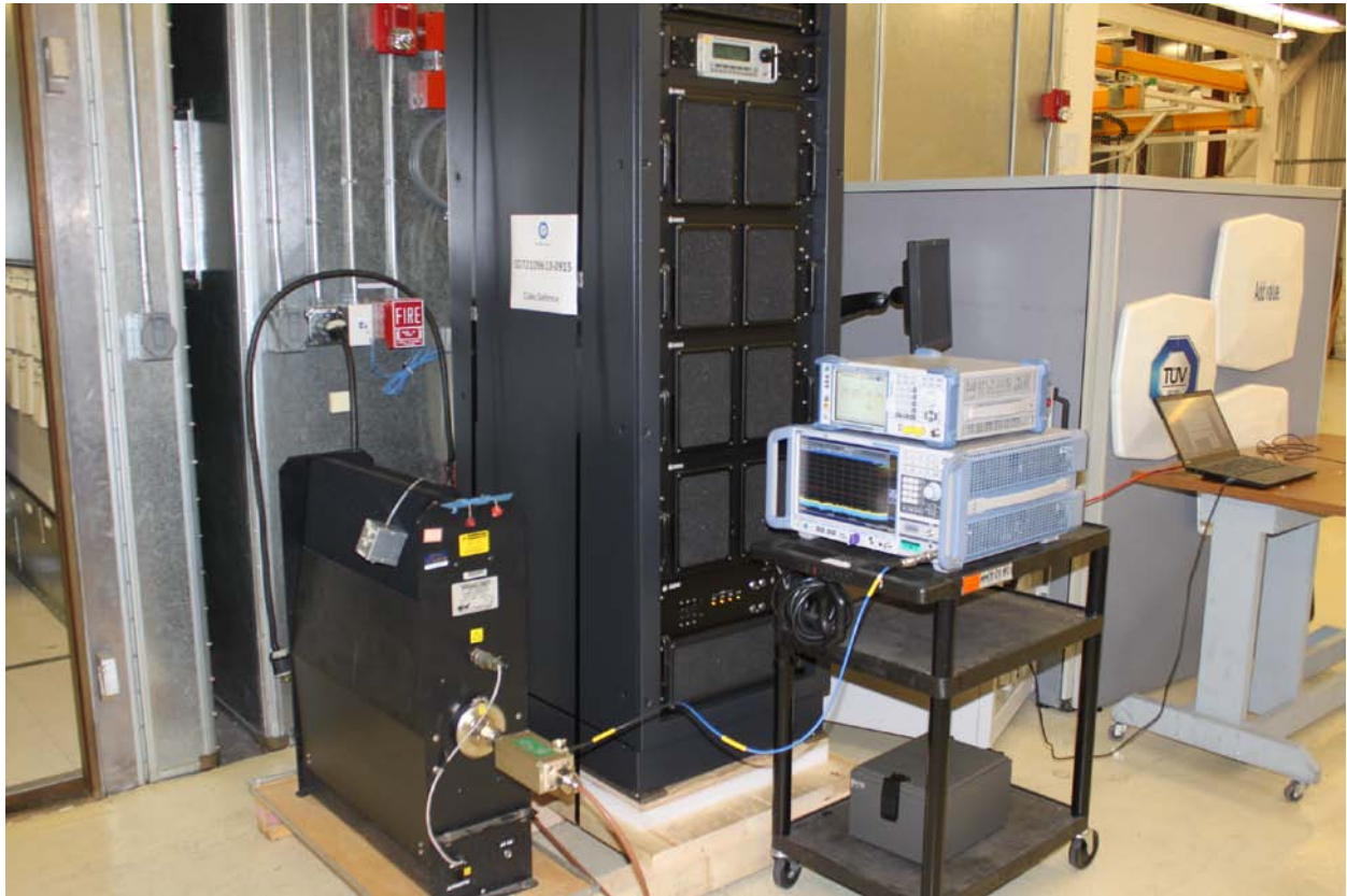
Occupied Bandwidth Test Setup