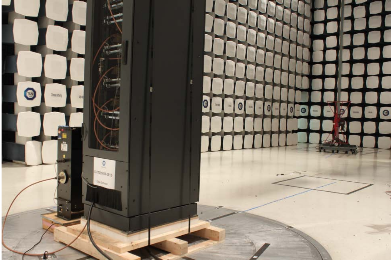
Radiated Emissions Test Setup (above 30 MHz)