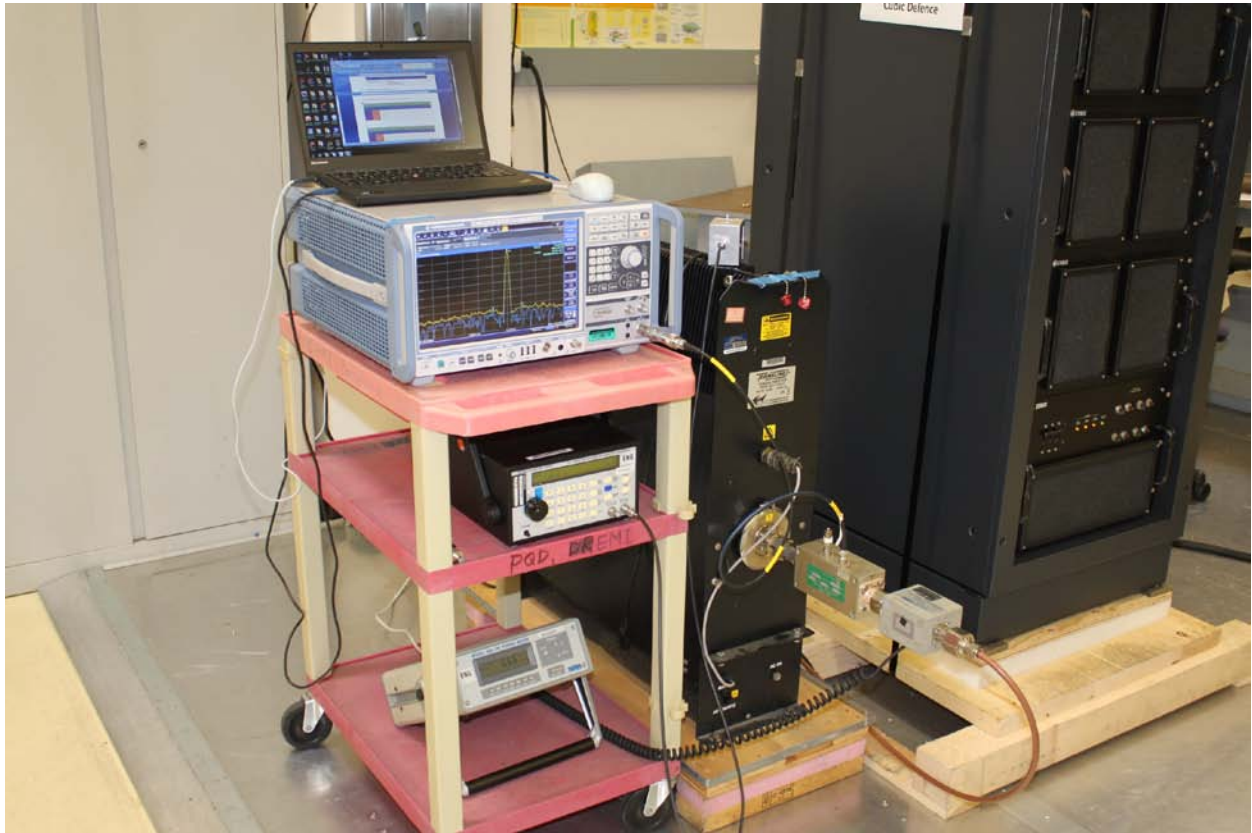
Conducted Power Measurement Test Setup