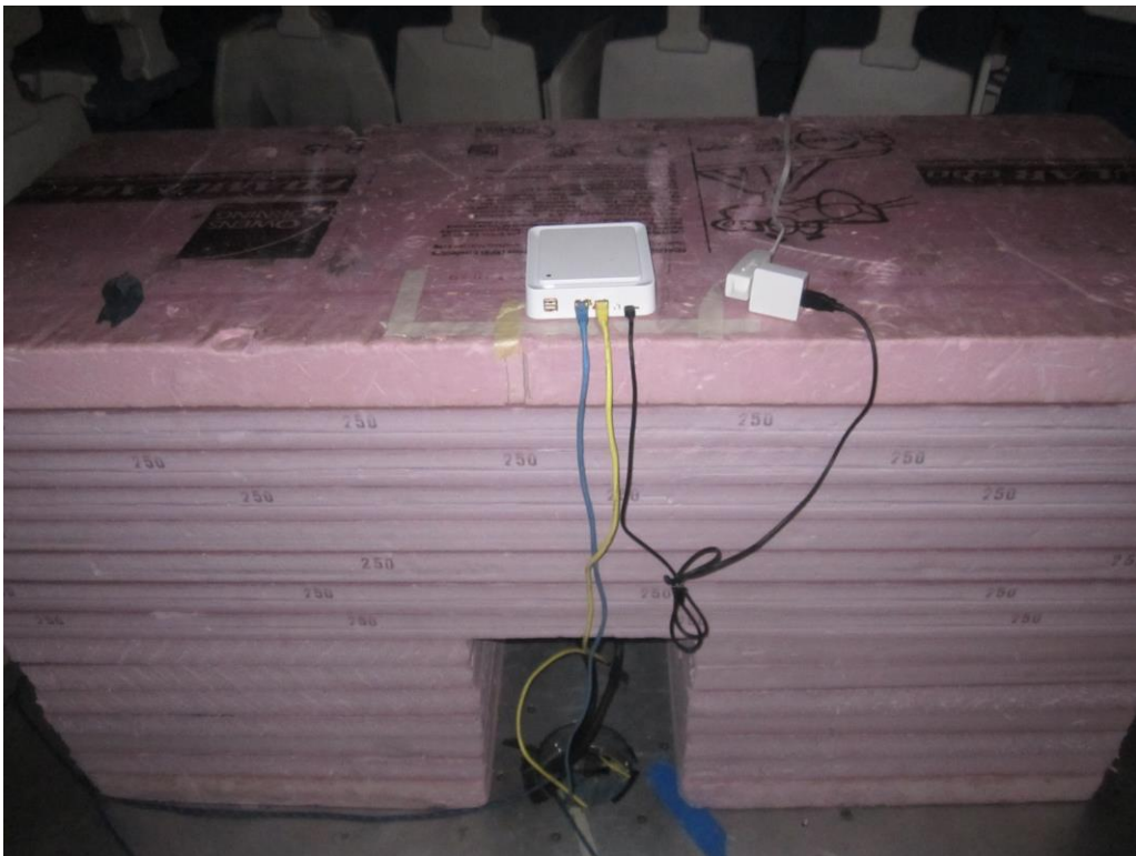
EMI Radiated - 30 to 1000 MHz (Rear)