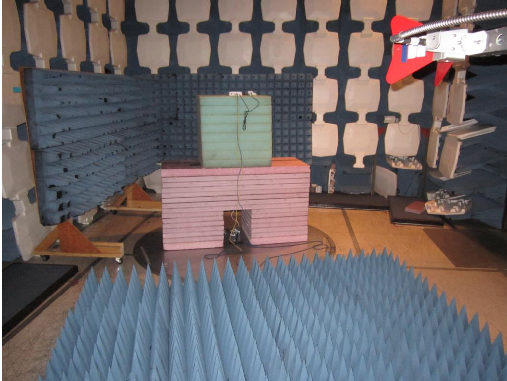
EMI Radiated - 1 to 6 GHz