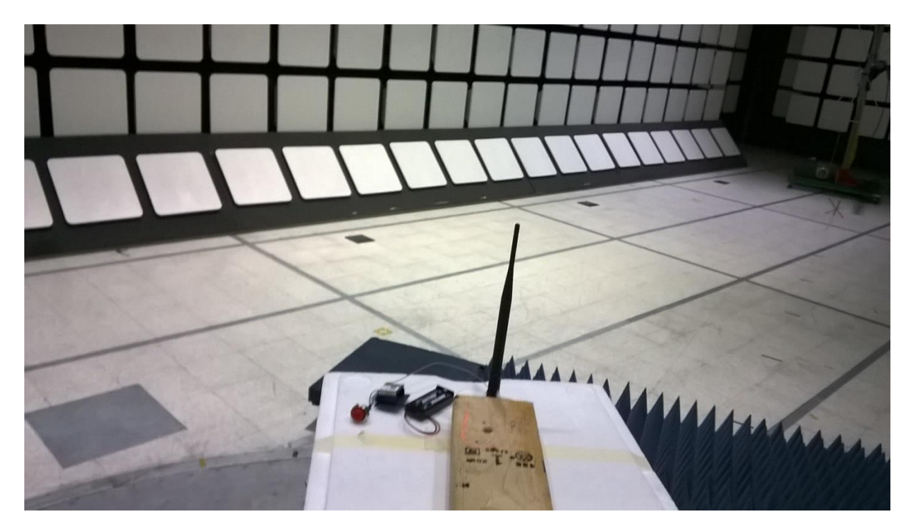
Figure 3 - Test Setup Photo, 1 - 10 GHz