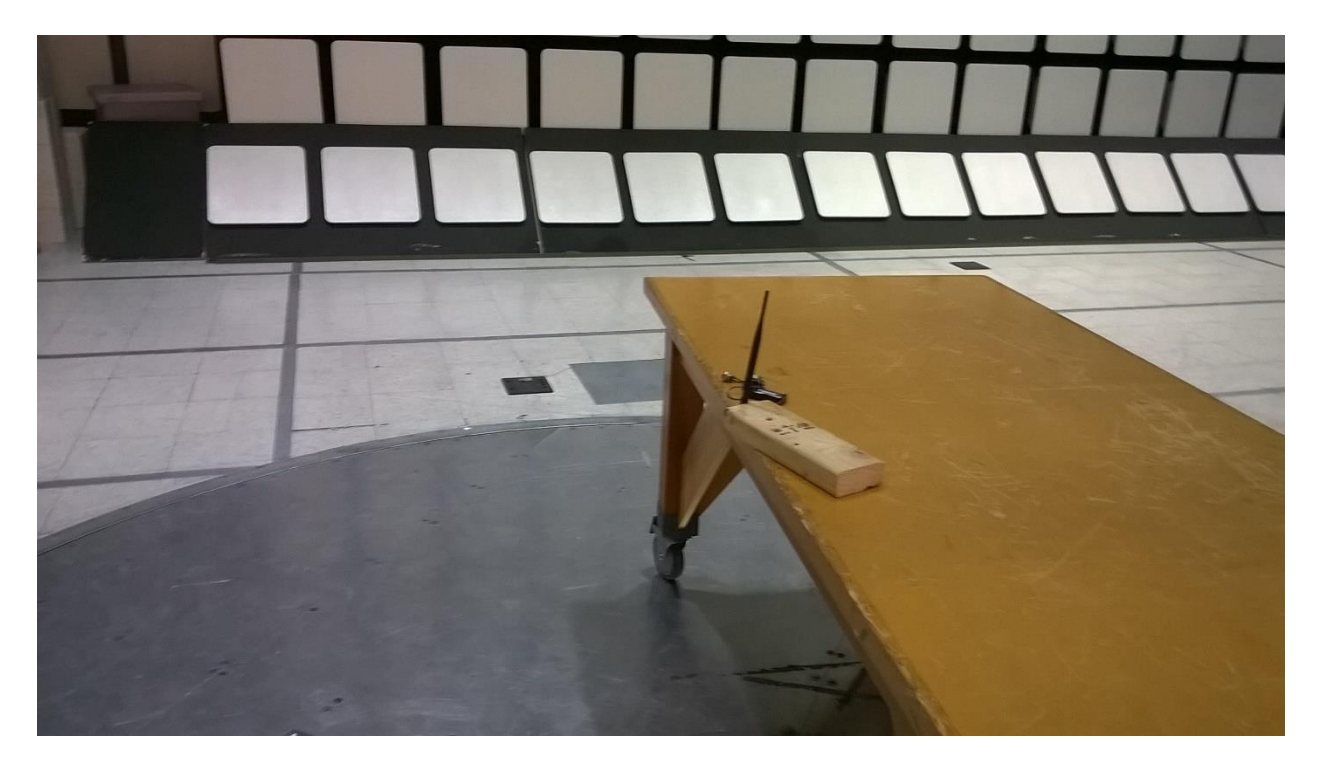
Figure 4 - Test Setup Photo, 30 MHz – 1GHz