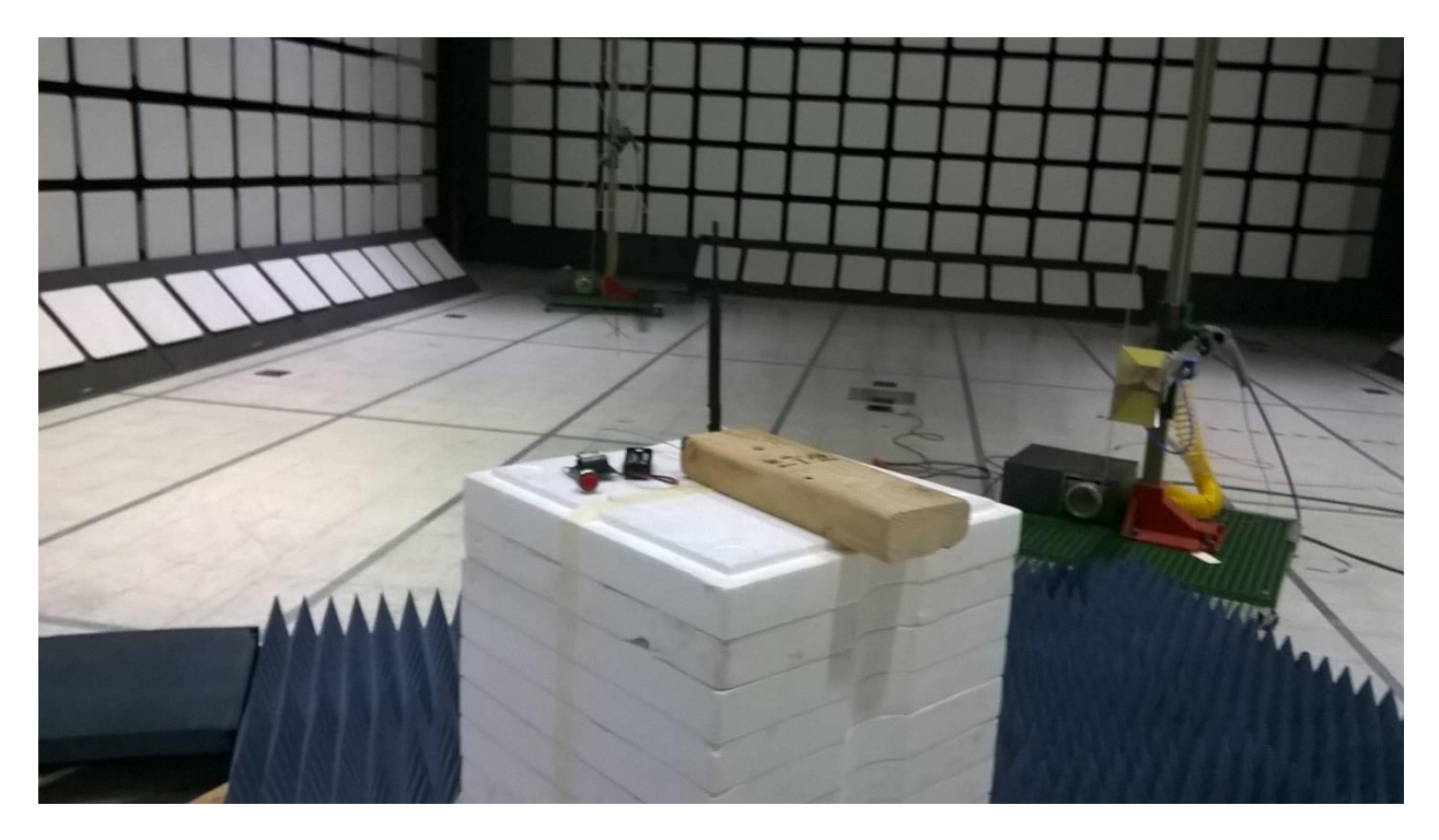
Figure 2 - Test Setup Photo, 1 - 10 GHz