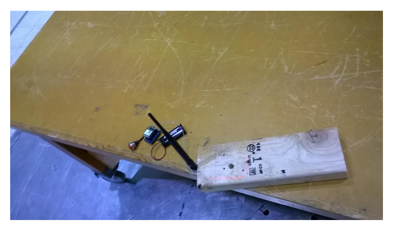
Figure 5 - Test Setup Photo, 30 MHz – 1GHz