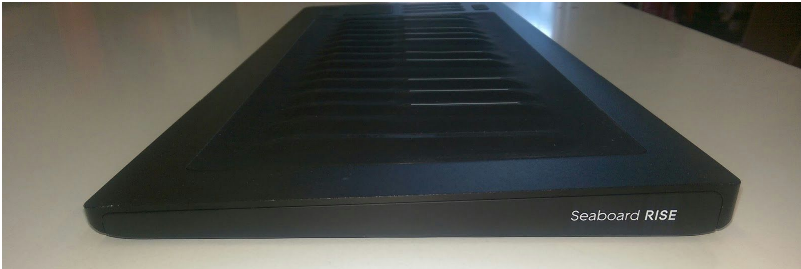
End View (RHS)