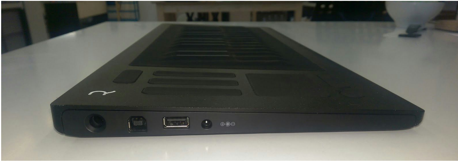
End View (LHS)