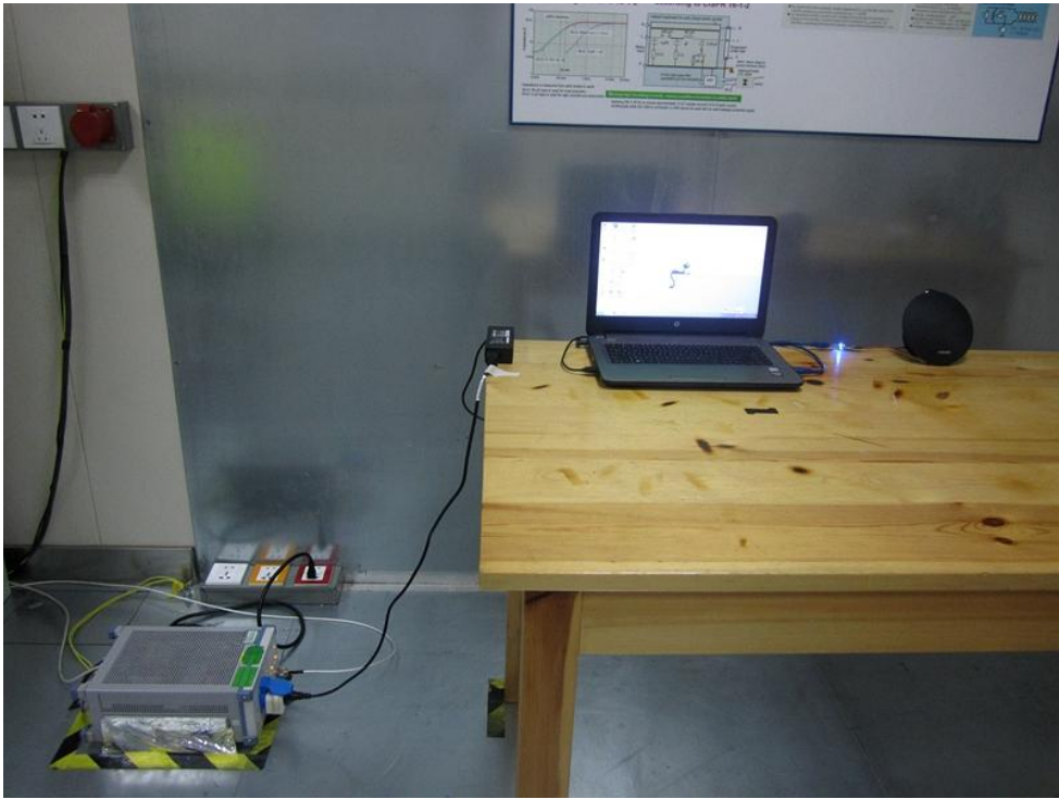
Radiated Emission Test below 1GHz