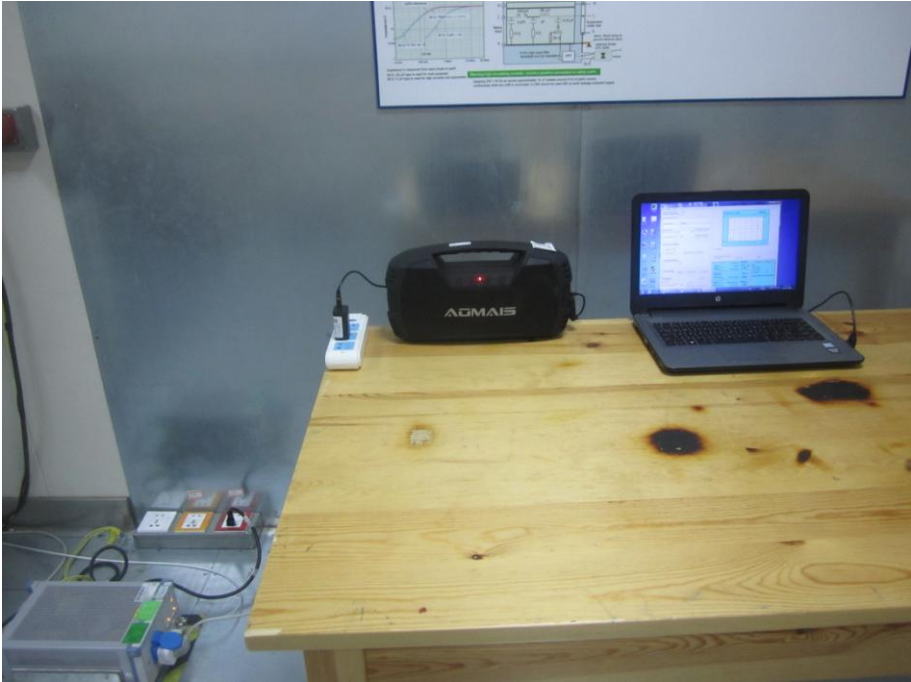
DSS&DTS radiation L