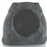
Rock Stone Speaker x 1