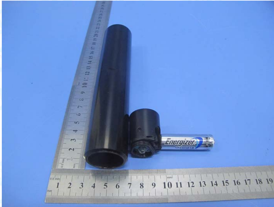
Photo 6 Internal of EUT