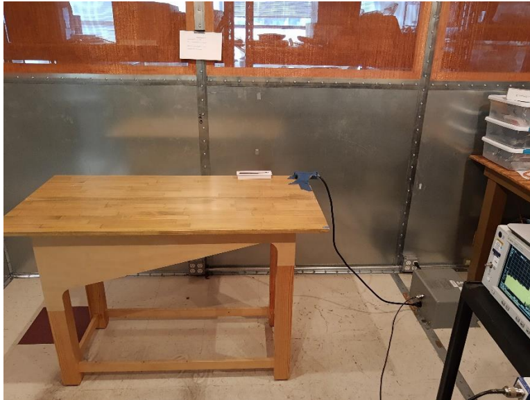
Figure 1: Conducted Emission Limits, Test Setup