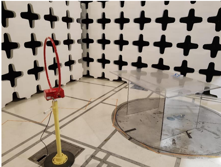
Figure 2: Radiated Emission: Limits of Electromagnetic Radiation Disturbance, setup below 30MHz - Parallel