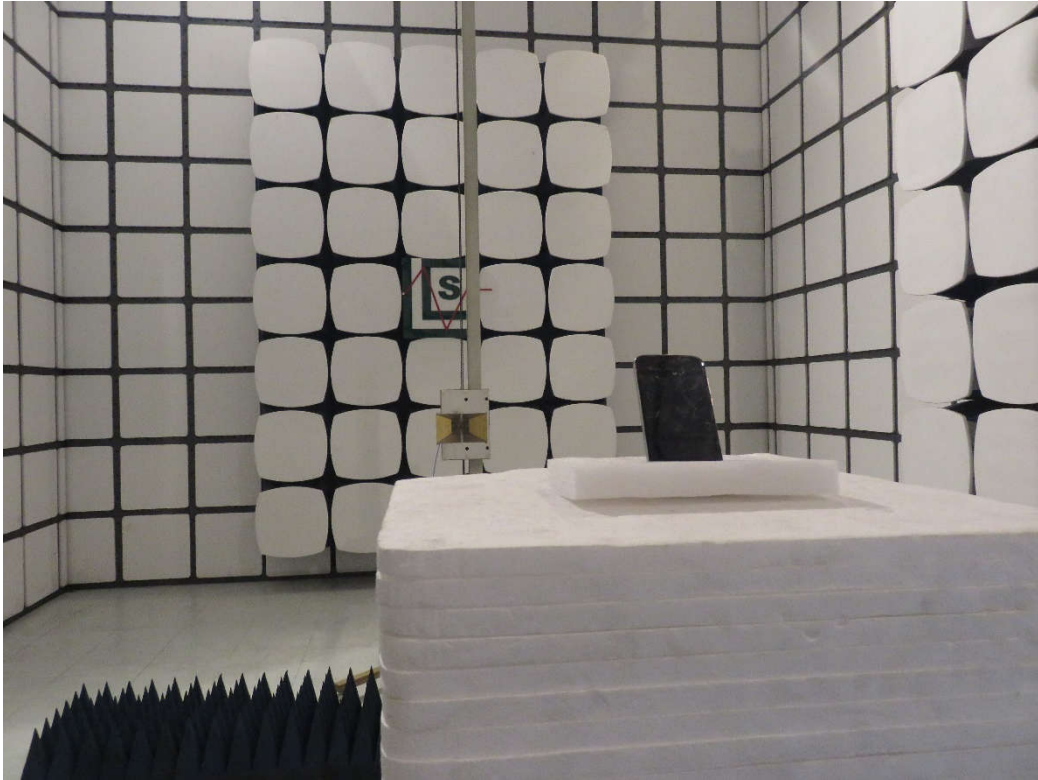
Spurious Emission above 1GHz