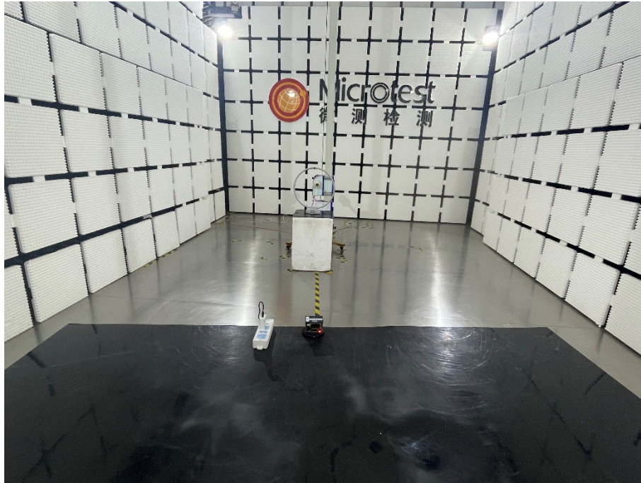
Radiated emissions – Below 1 GHz