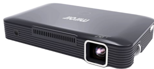
miroir HD MINI PROJECTOR MP150W