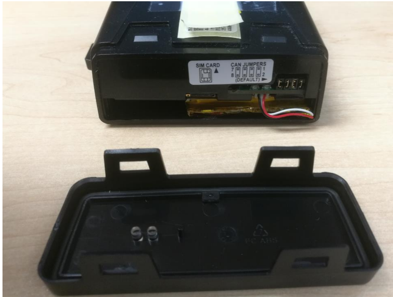
Figure 3: View of MiX 460C-4G-B with Rear Panel Removed (backup battery inserted)