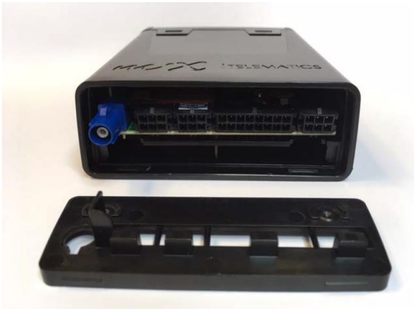
Figure 1: View of MiX 460C-4G/MiX 460C-4G-B with Front Panel Removed