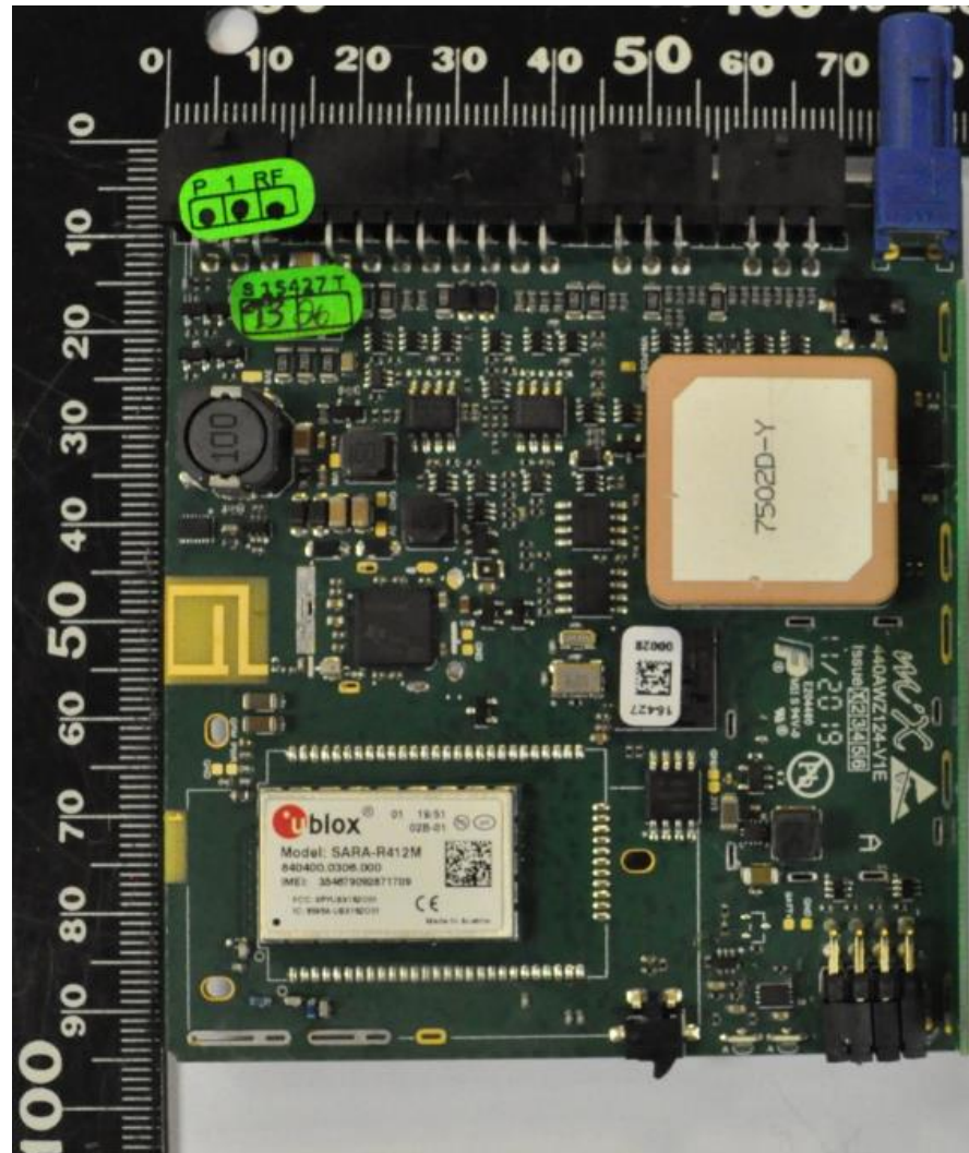
Figure 5: View of Main PCB – Modem and Bluetooth without shields