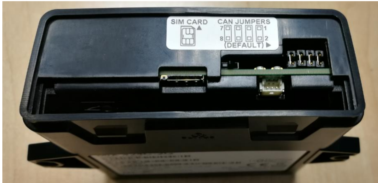
Figure 2: View of MiX 460C-4G with Rear Panel Removed