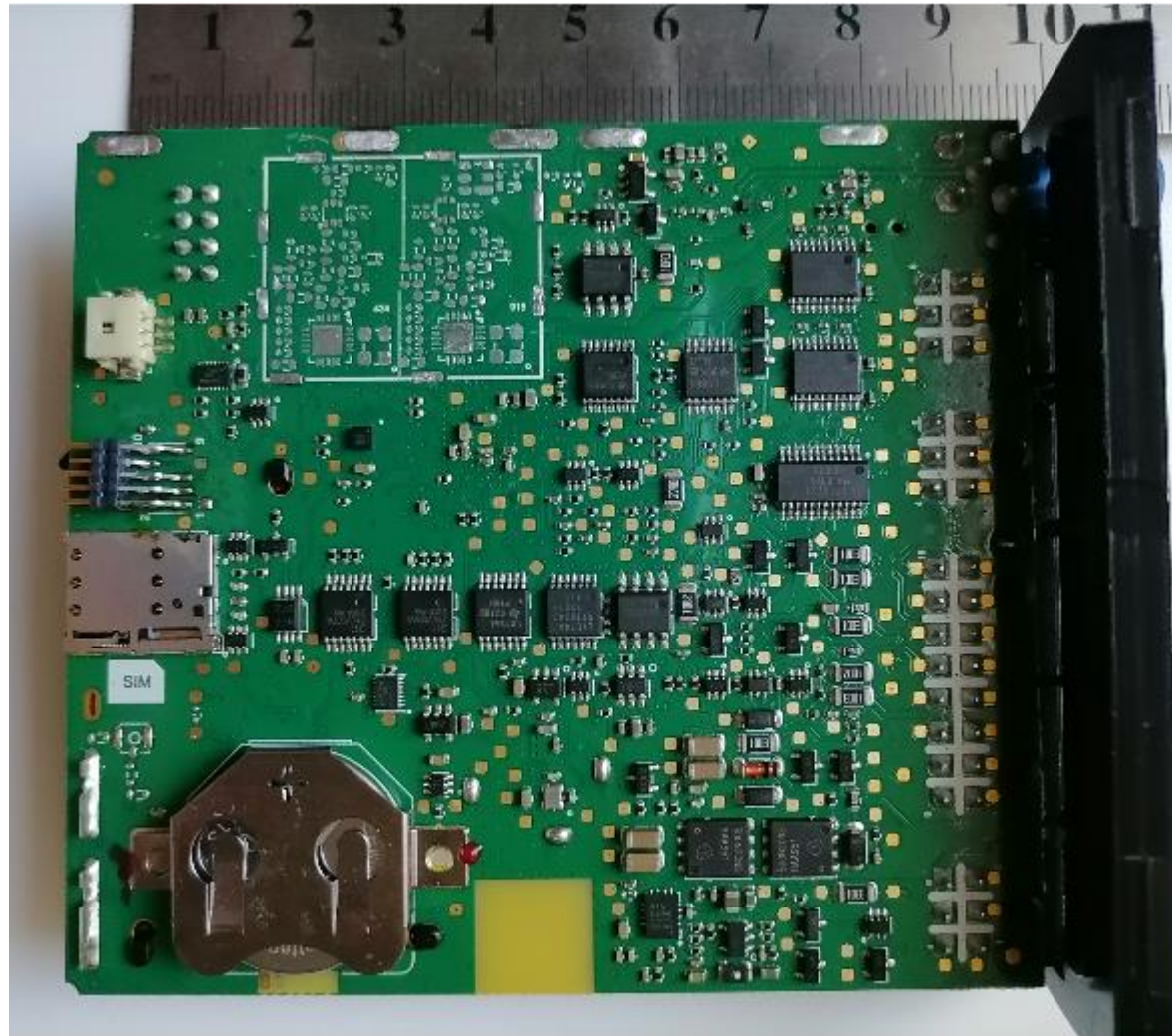
Figure 8: Bottom Side of PCB