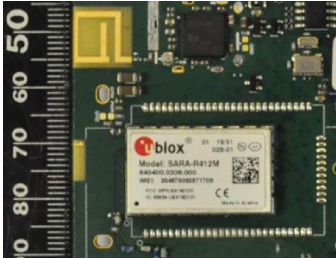
Figure 6: Close up view of modem and Bluetooth