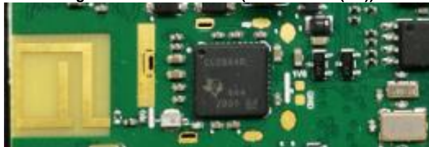
Figure 5: View of Bluetooth Circuit (MiX 450C-4G (US))