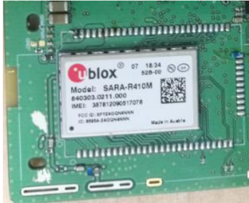
Figure 4: View of modem (MiX 450C-4G (US))