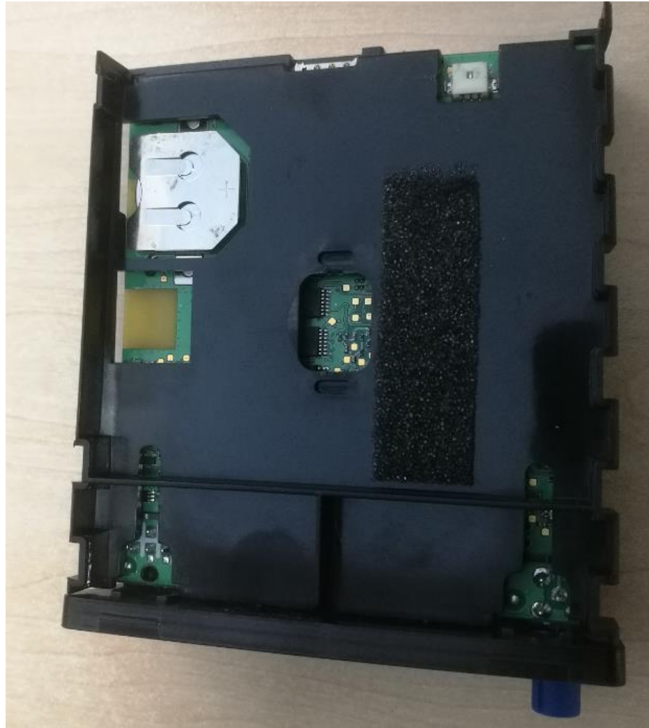
Figure 6: Bottom Side of Main PCB on Carrier – battery NOT fitted (MiX 450C-4G)