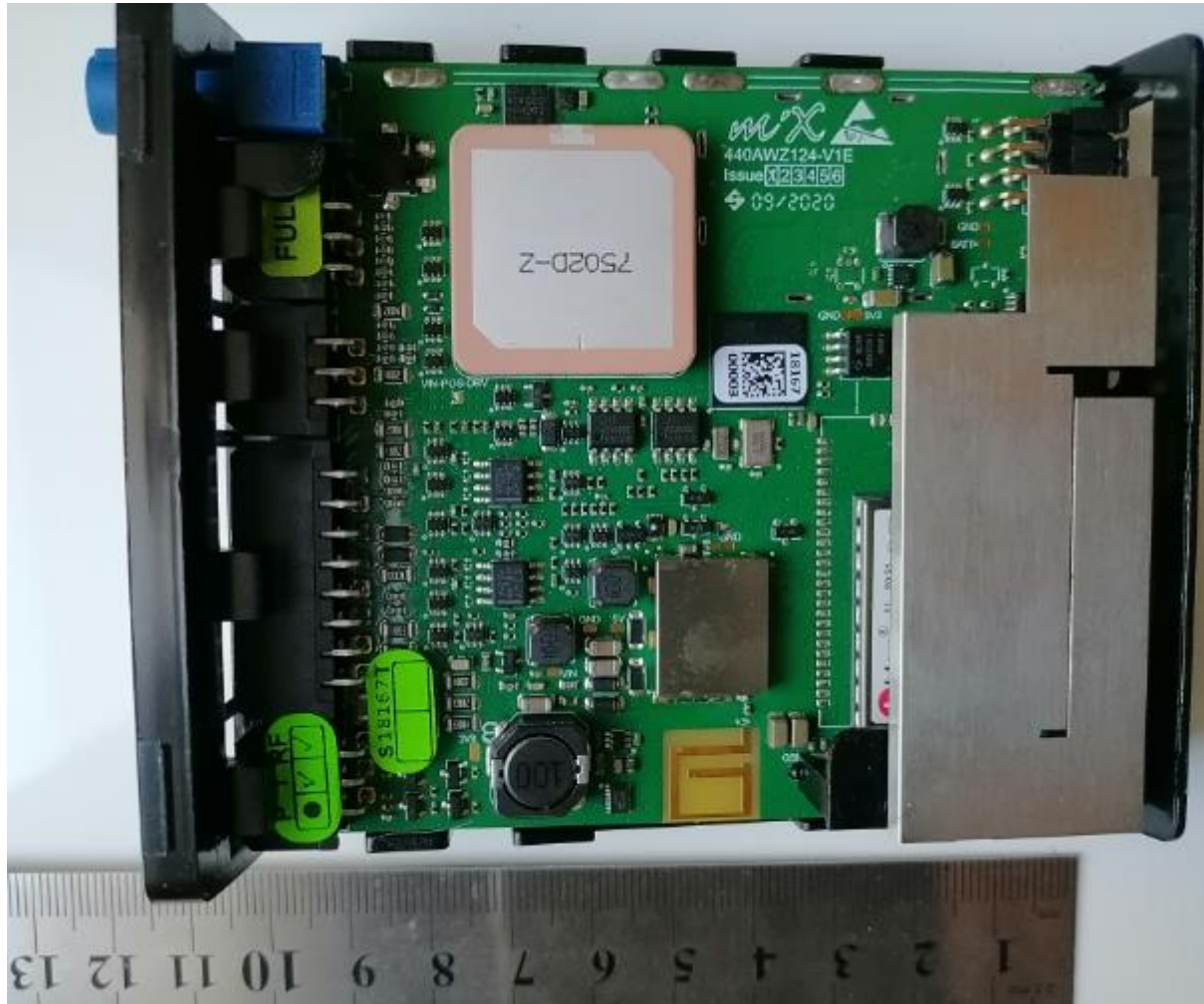
Figure 3: View of PCB on Carrier (top view)