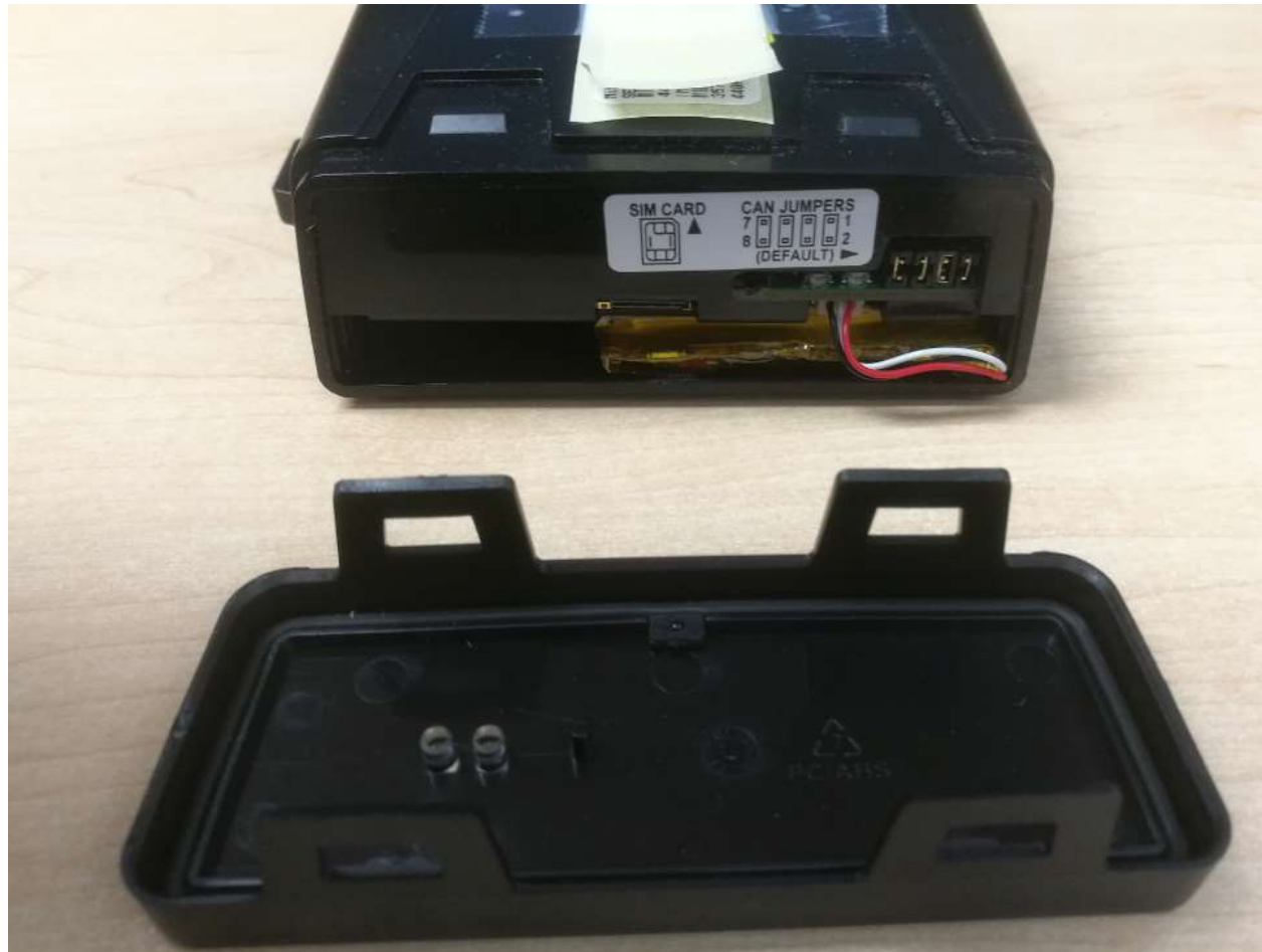
Figure 3: View of MiX 44MC-3G-B with Rear Panel Removed (backup battery inserted)