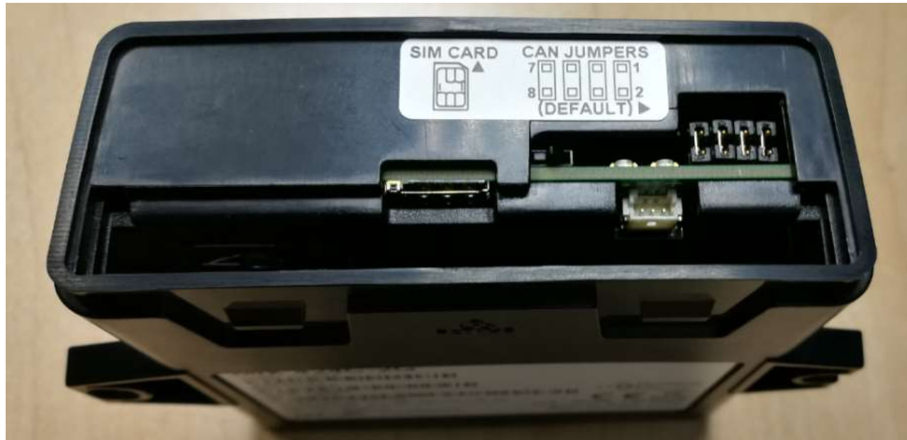
Figure 2: View of MiX 44MC-3G with Rear Panel Removed