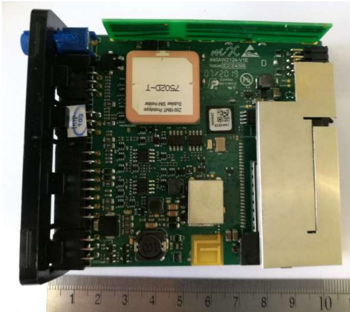
Figure 4: View of Main PCB on Carrier (top view)