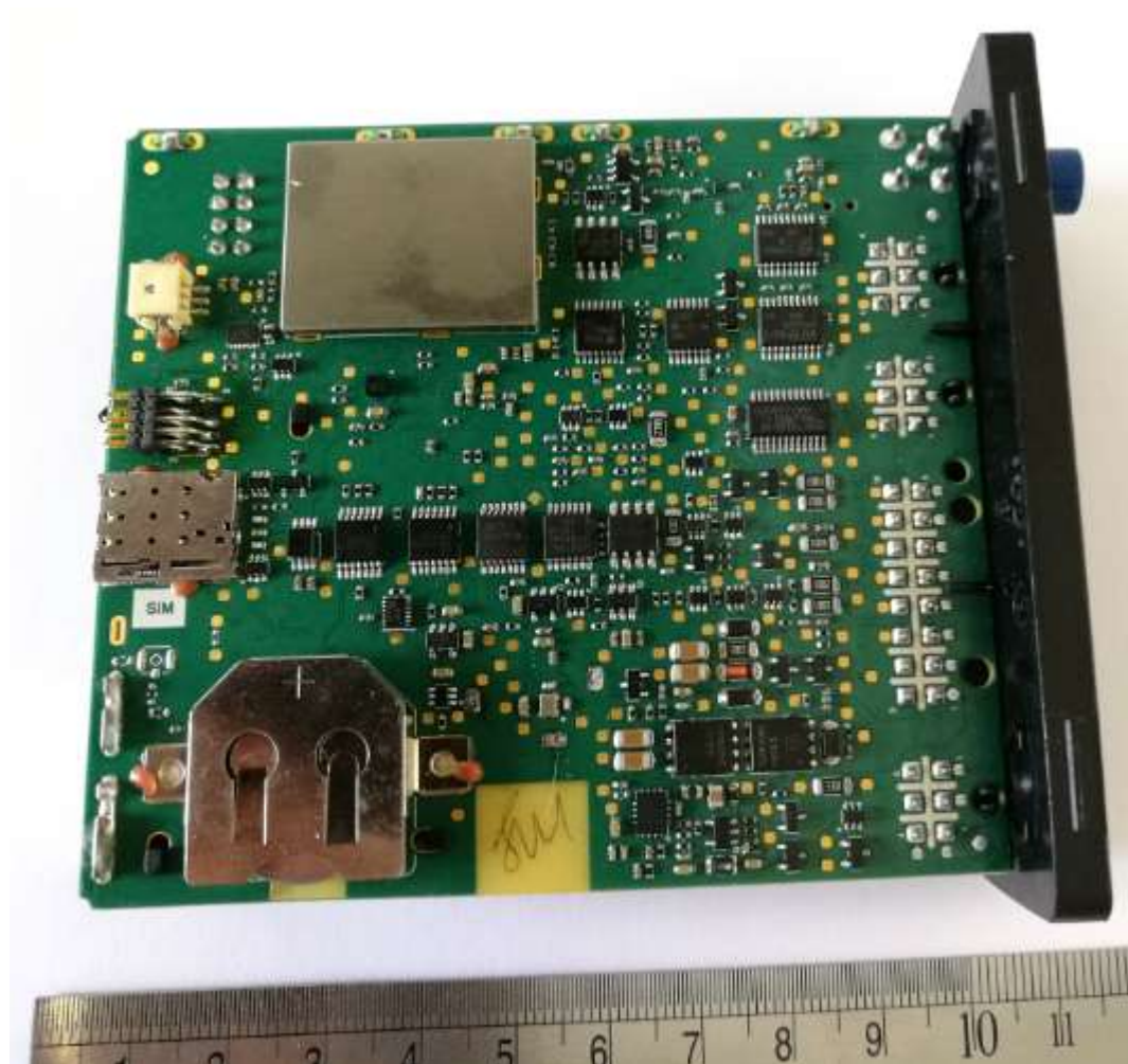
Figure 7: Bottom Side of Main PCB