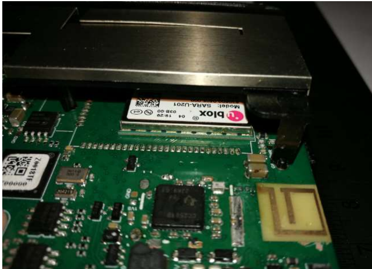
Figure 5: View of Main PCB – Modem and Bluetooth without shield