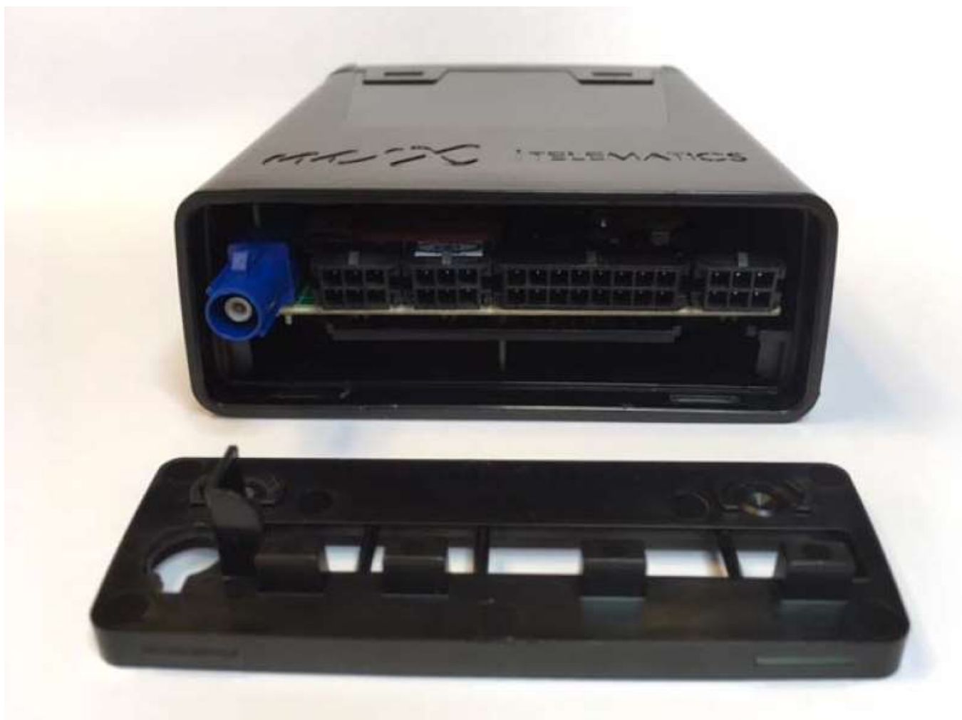
Figure 1: View of MiX 44MC-3G/MiX 44MC-3G-B with Front Panel Removed