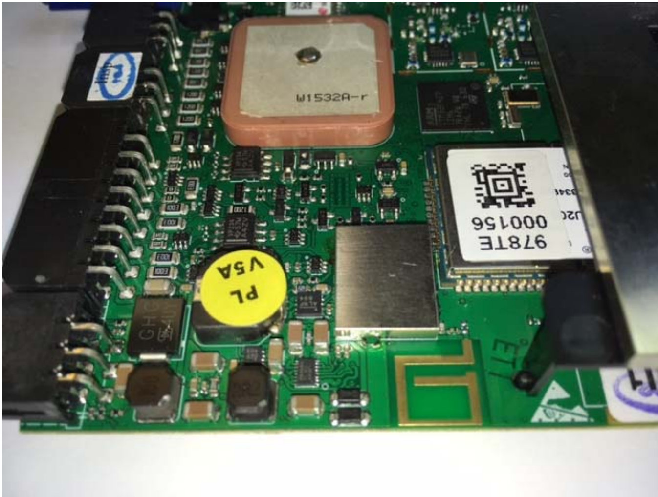
Figure 8- View of Bluetooth Antenna on Main PCB