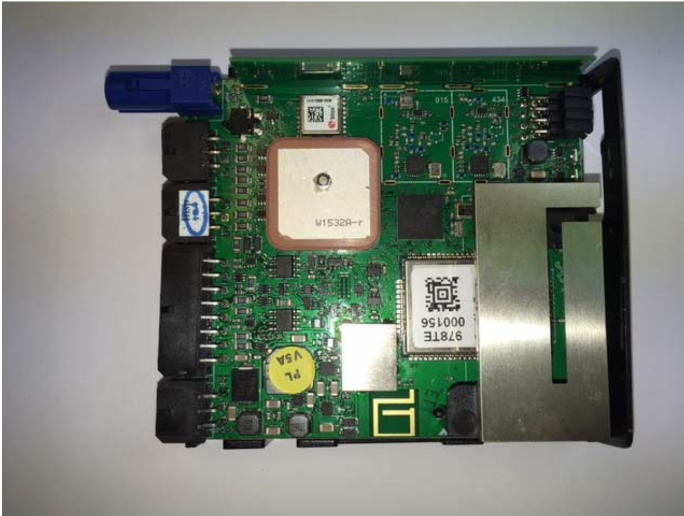
Figure 3- View of Main PCB on Carrier