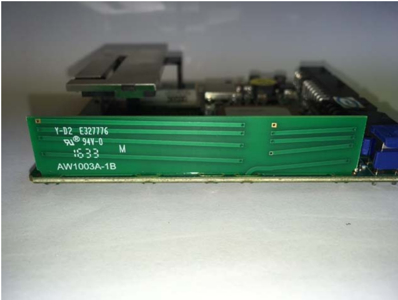
Figure 7- Side View of Main PCB Showing 434 & 915MHz Antenna