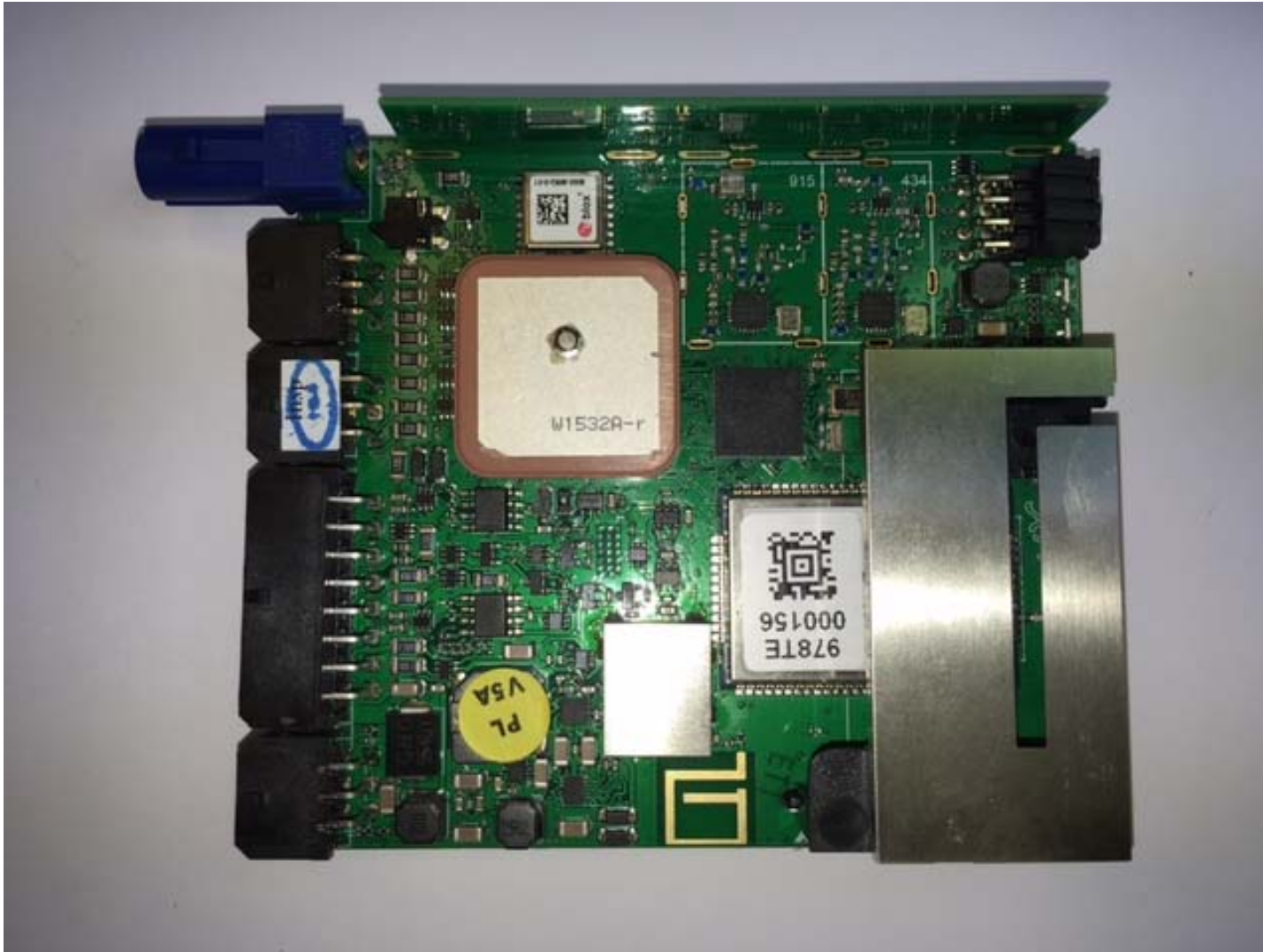
Figure 5- Top Side of Main PCB