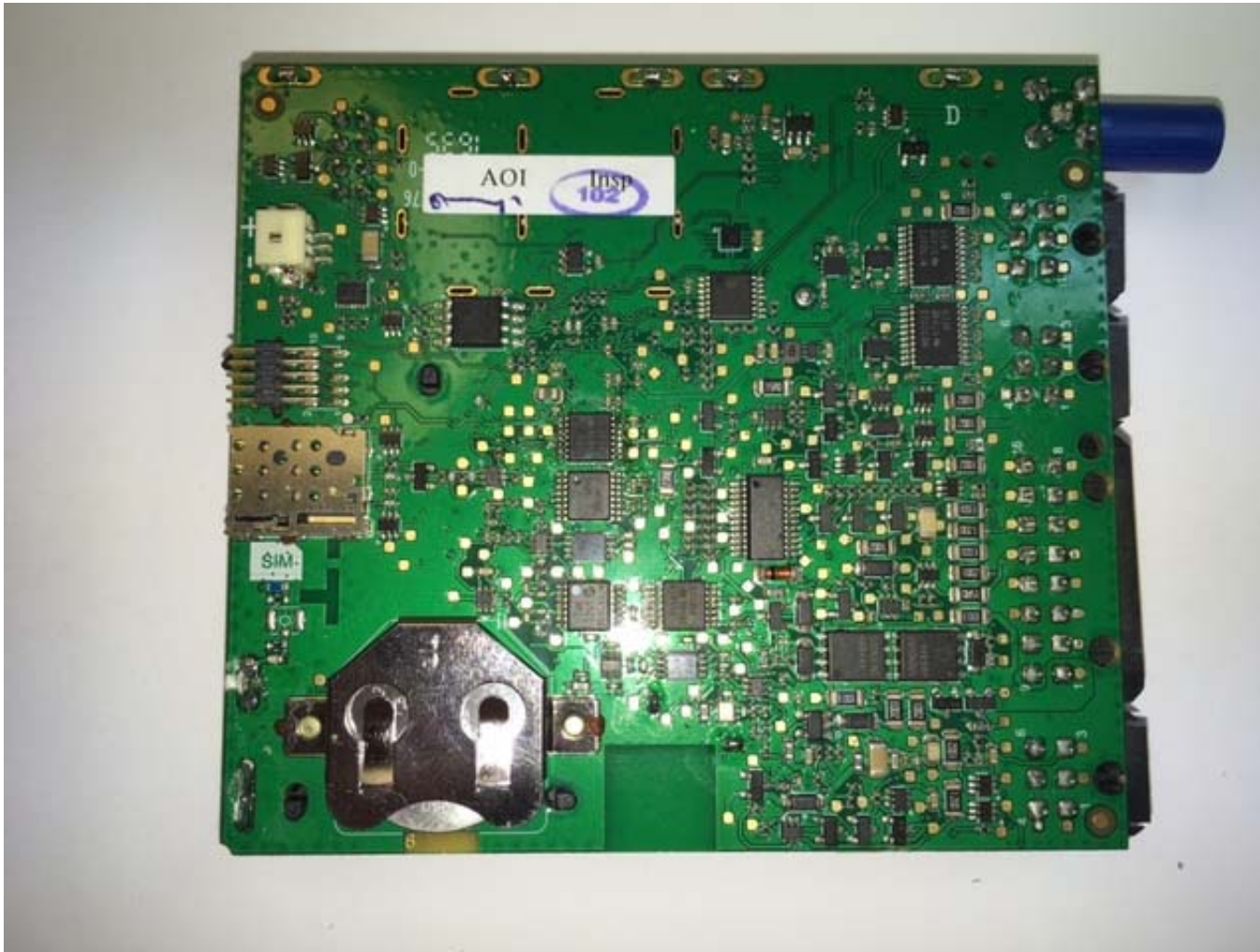
Figure 6- Bottom Side of Main PCB