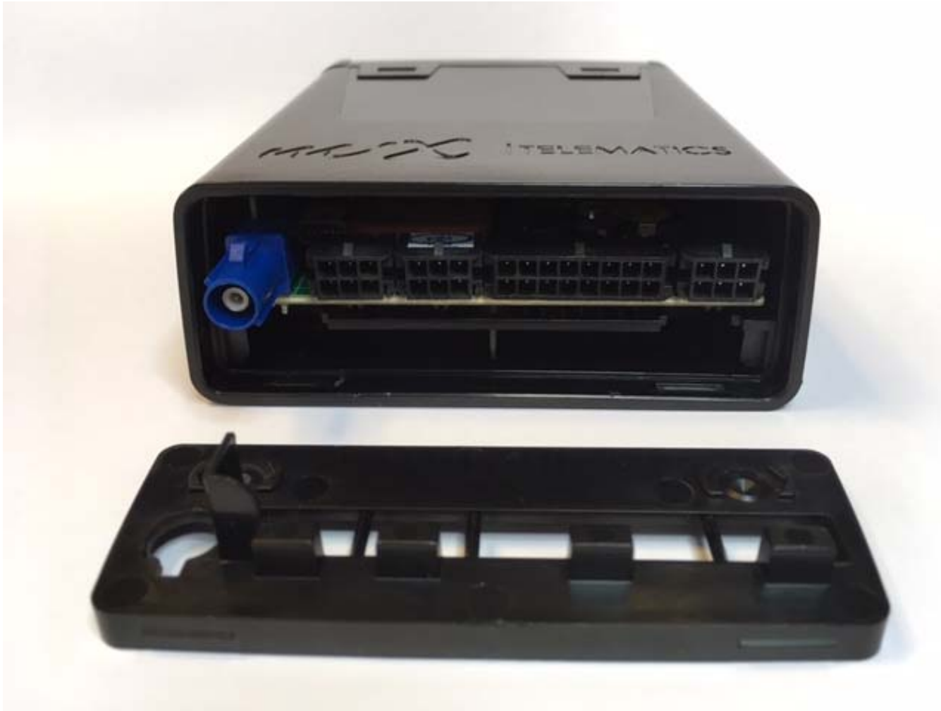
Figure 1- View of MiX41MC-3G With Front Panel Removed