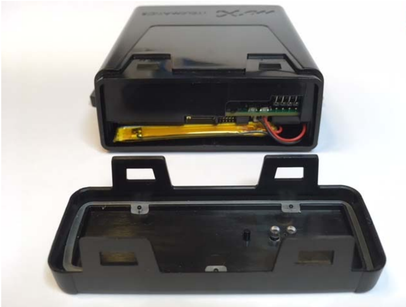
Figure 2- View of MiX41MC-3G With Rear Panel Removed