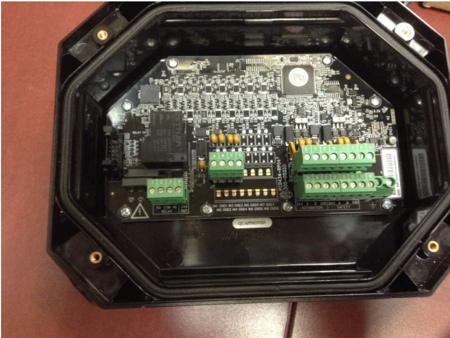
Bottom PCB of TR-2IN-1REL- components side