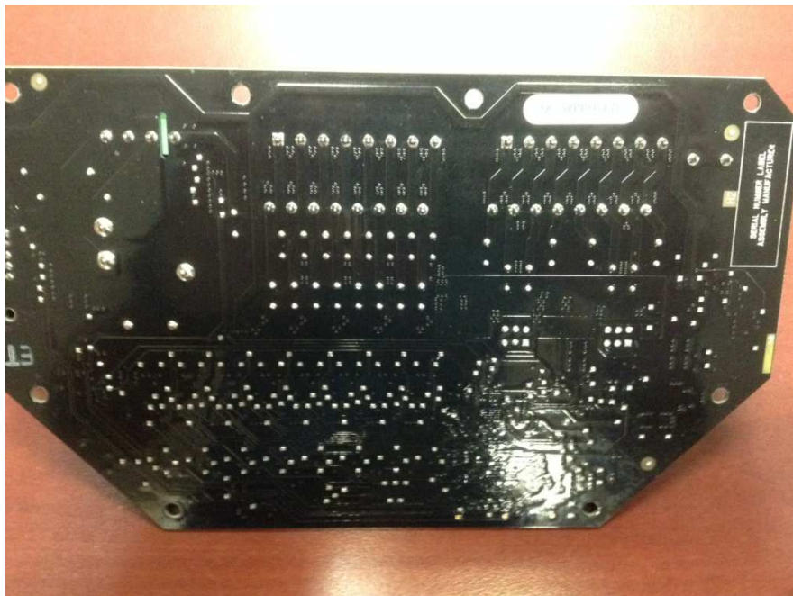
Bottom PCB of the KP-8IN-1REL – solders side