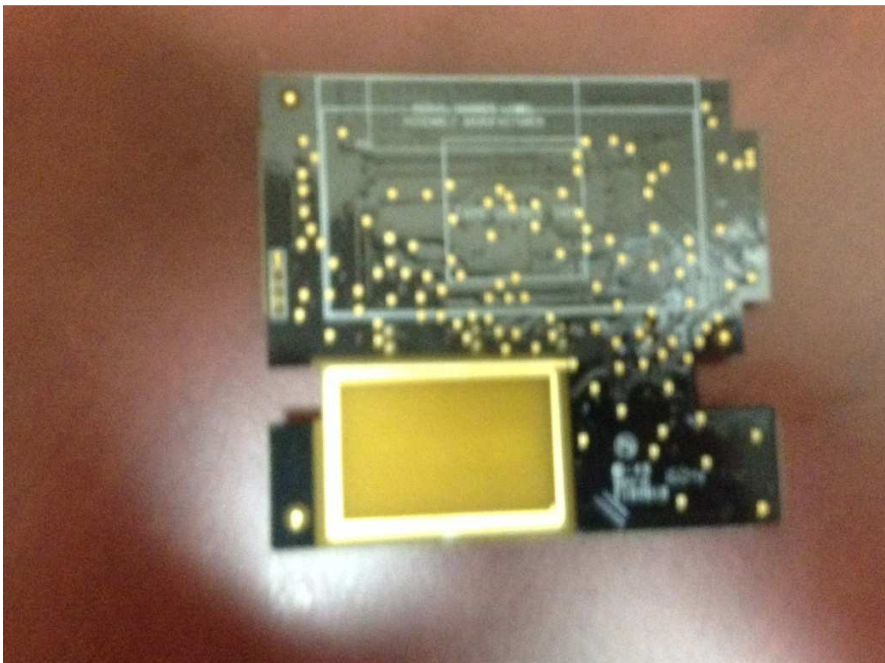
Top PCB of TR-2IN-1REL- solders side