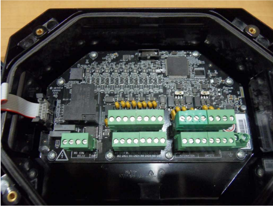
Bottom PCB of the KP-8IN-1REL – components side