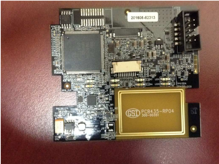
Top PCB of TR-2IN-1REL-components side