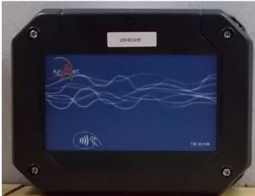
Real view of TR-2IN-1REL