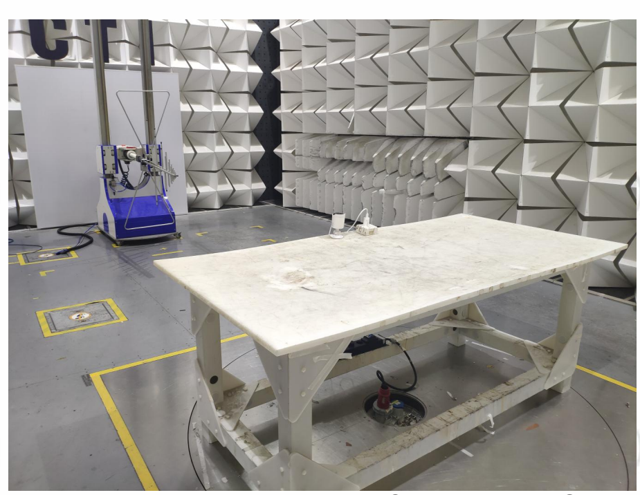
Radiated spurious emission Test Setup-2(Below 1GHz)