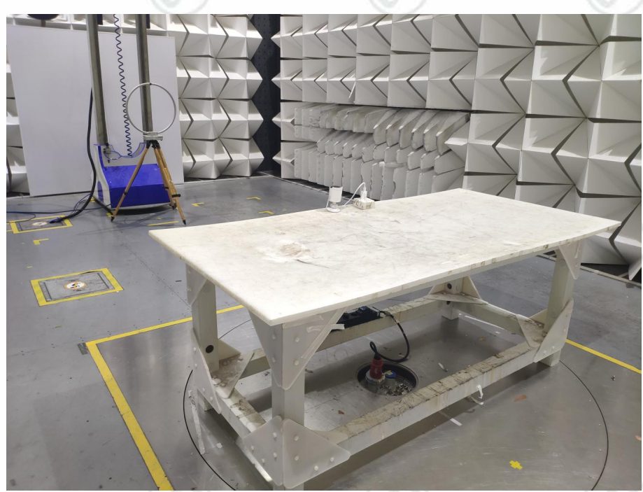
Radiated spurious emission Test Setup-1(Below 30MHz)