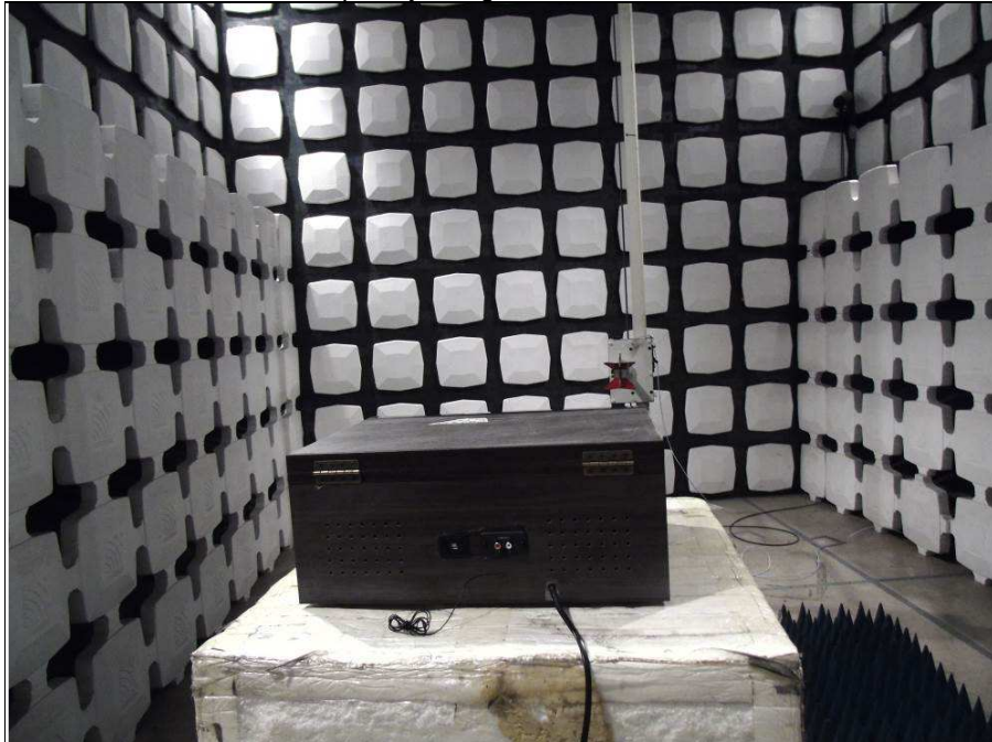
Frequency Range < Above 1GHz >