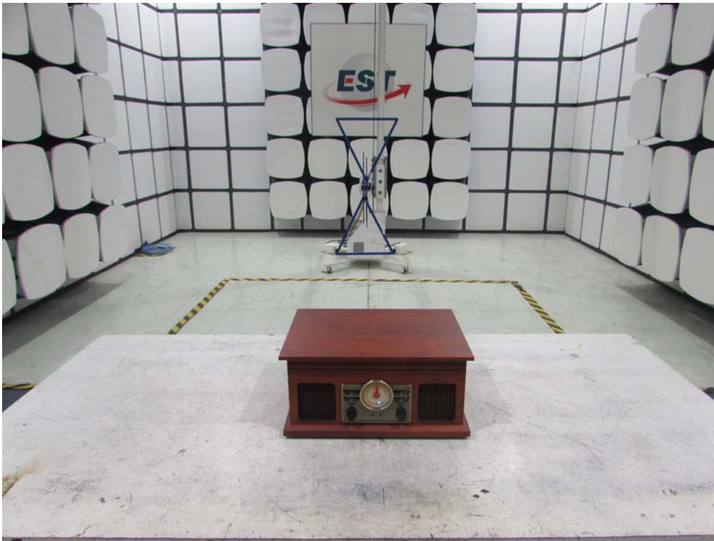
Radiated Test (1000-25000 MHz)