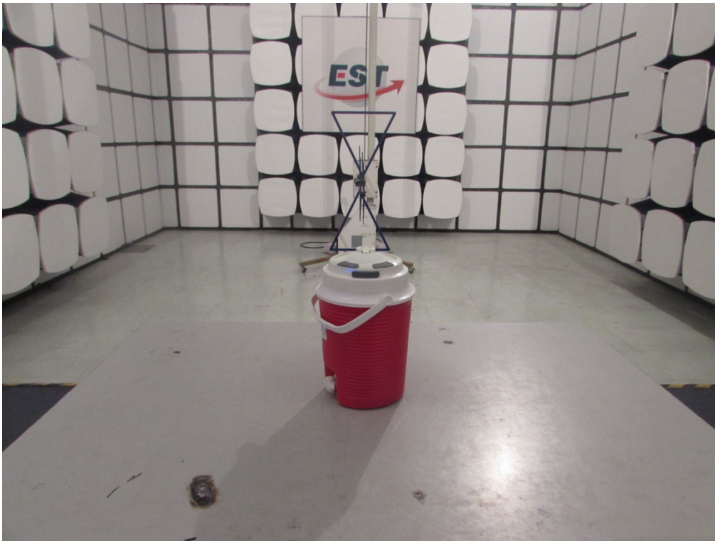
Radiated Test (1000-25000 MHz)