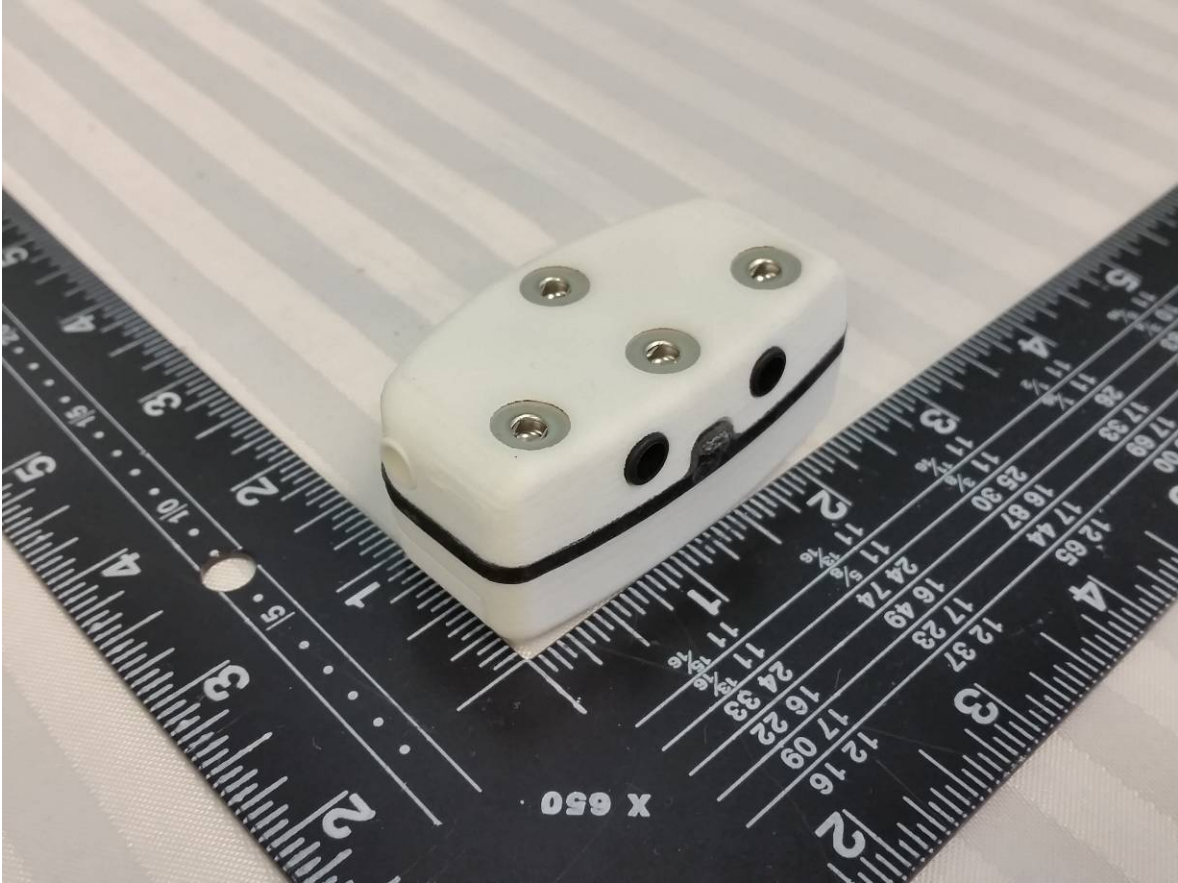
Figure 2 – EUT External Photo 2