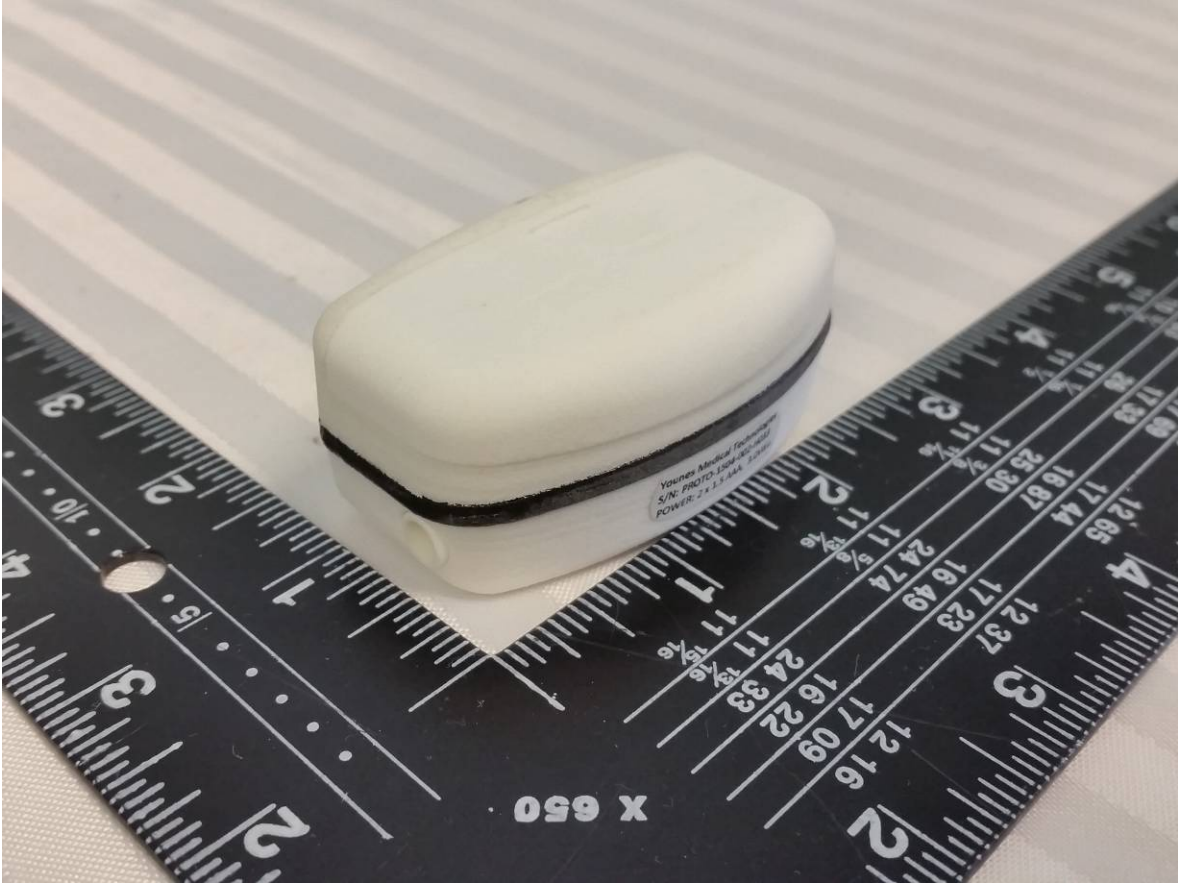
Figure 1 – EUT External Photo 1