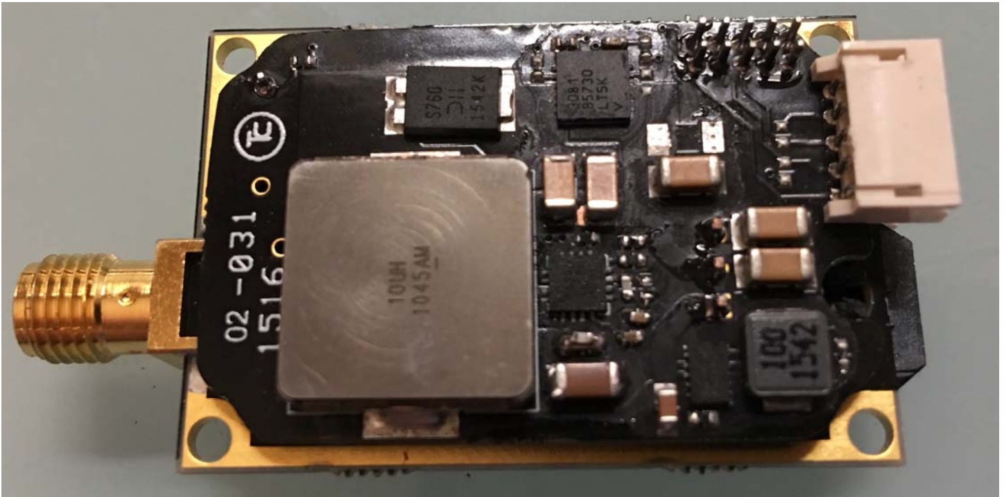
Power Supply Board, Side 1 (Note that RF board is attached under the power board in this photo.)