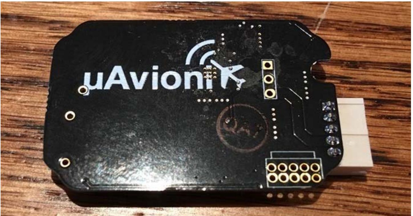
Power Supply Board, Side 2