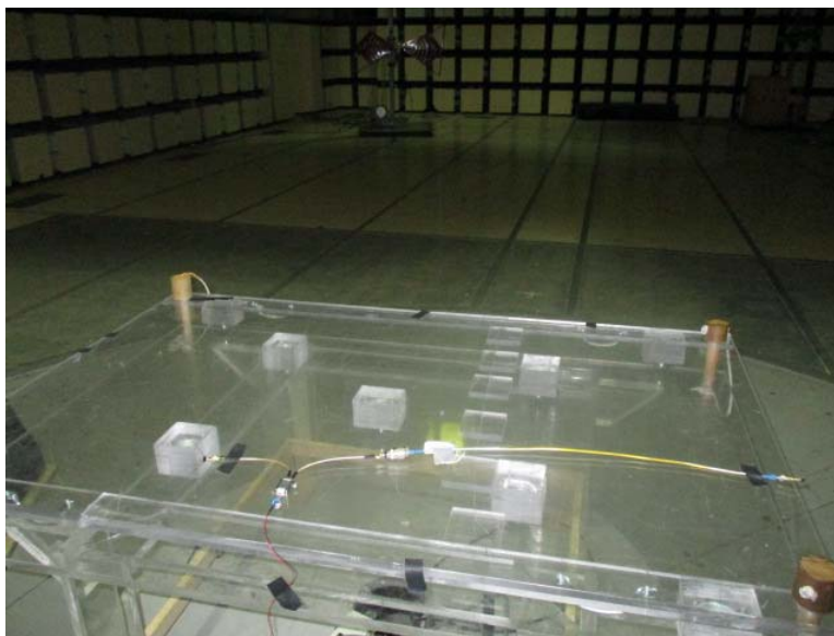
Radiated Measurements to 1 GHz, Back