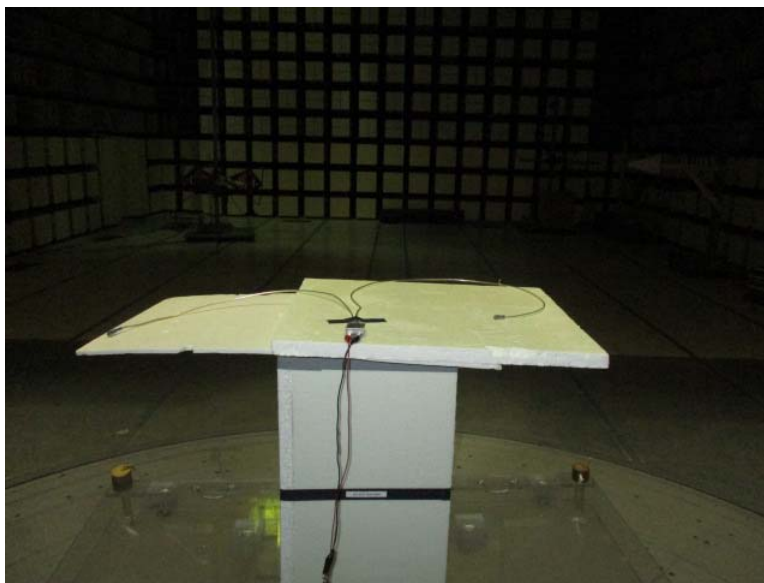
Radiated Measurements > 1 GHz, Back