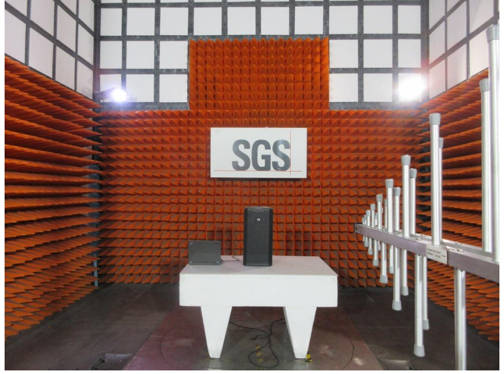
Radiated Spurious Emissions Below 1GHz