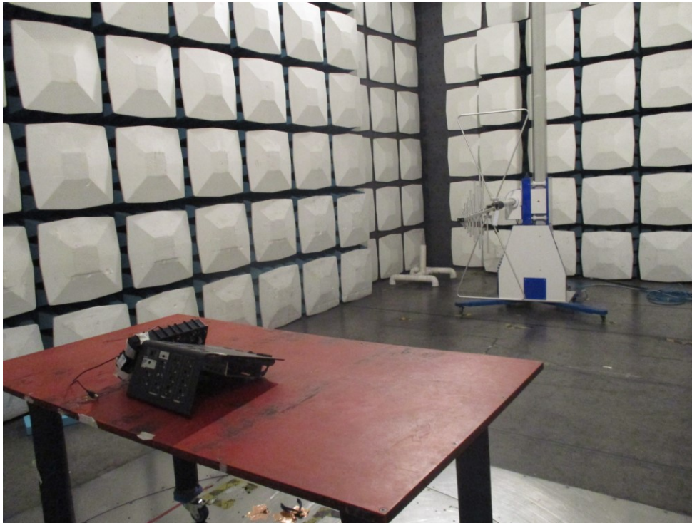
Photograph 2: Set-up for Radiated Spurious Emission, Above 1GHz