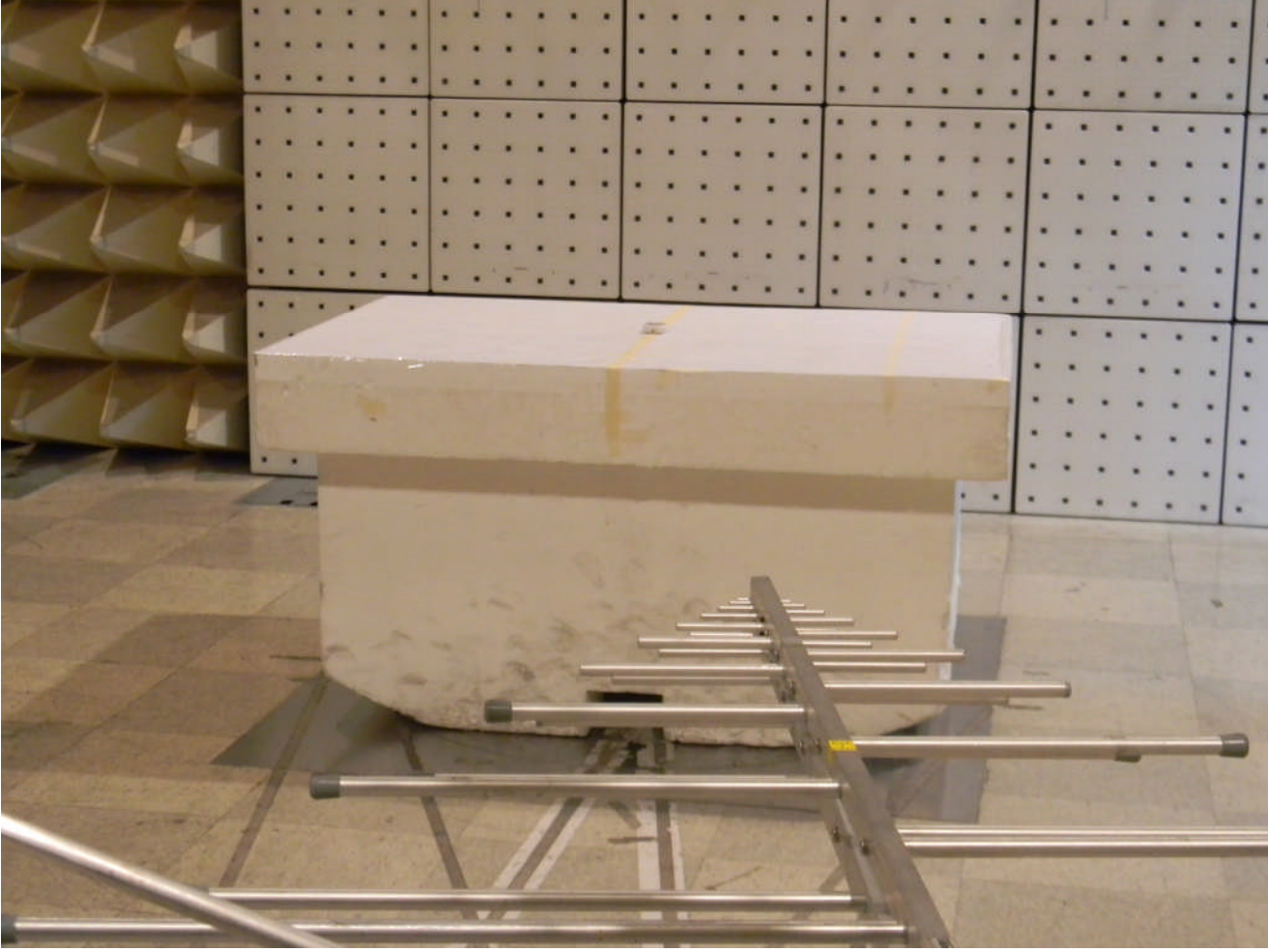
RE Front(9 kHz~ 30 MHz)_ Blood Glucose Measurement Mode