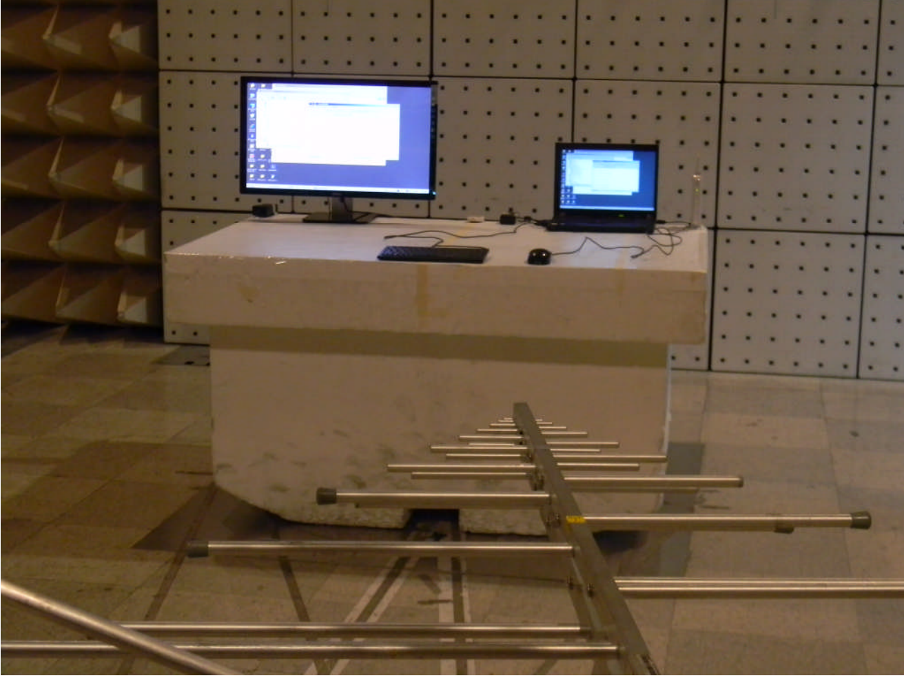
RE Front (3m method below 1 GHz)_ USB Communication Mode