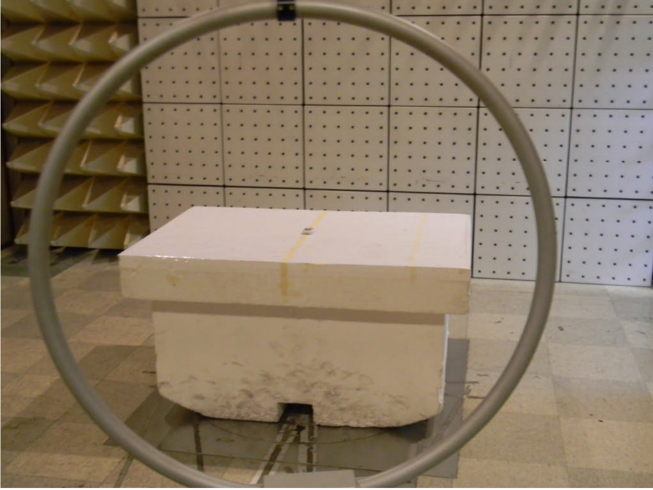
RE Front(30 MHz ~ 1 GHz)_ Blood Glucose Measurement Mode