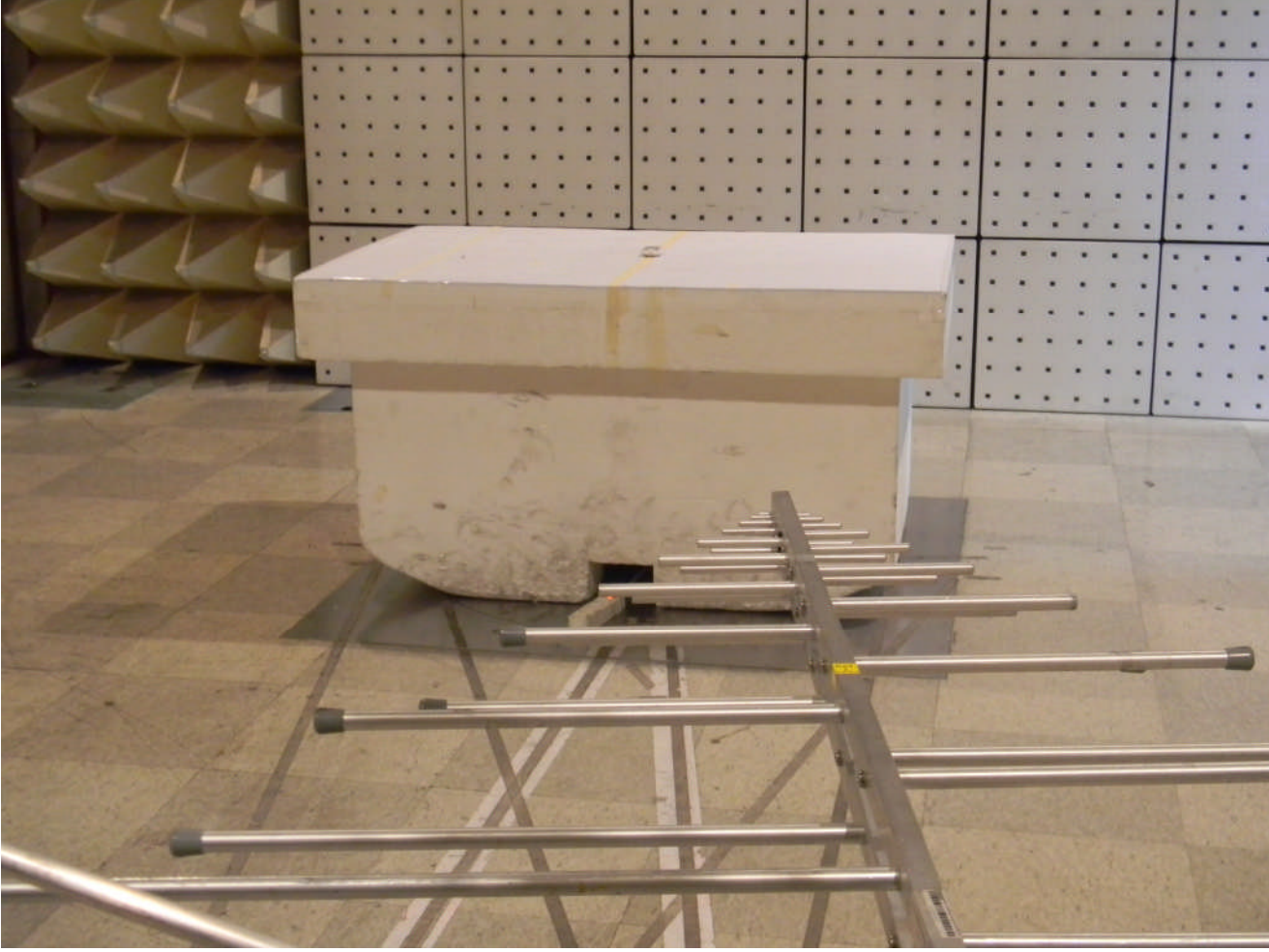
RE Rear(9 kHz~30 MHz)_ Blood Glucose Measurement Mode