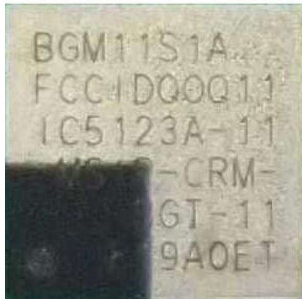
Close Up of Secondary BT Module Label