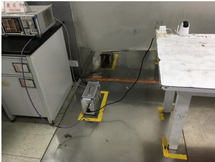
Conducted Emissions Test Setup