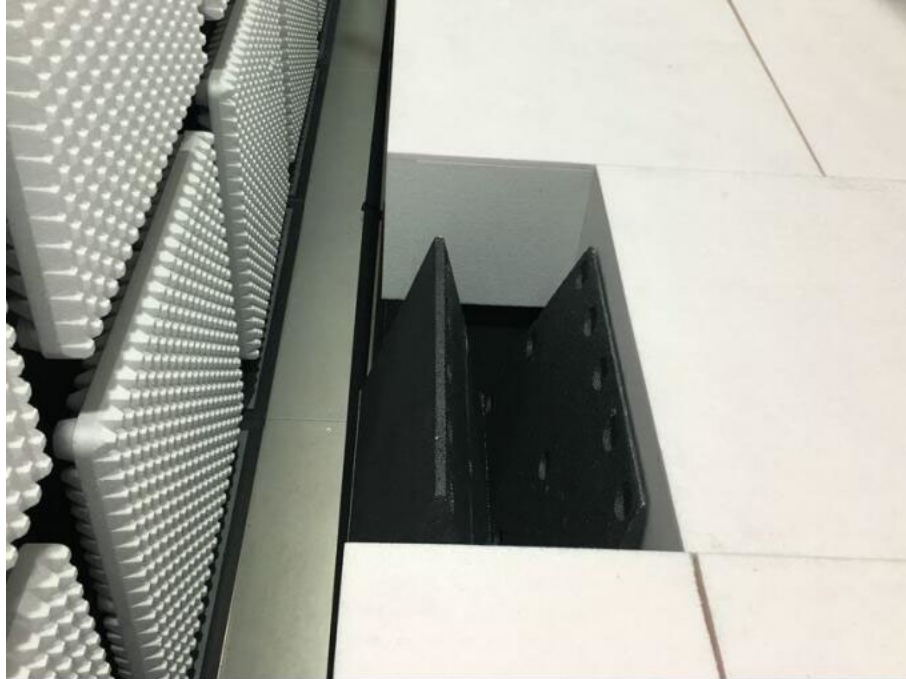
Radiated spurious emission Test Setup-3(Above 1GHz) There are absorbing materials under the ground.