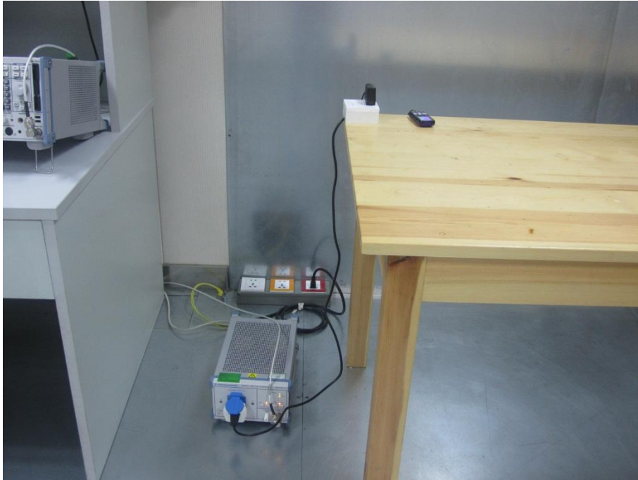
DSS radiation L