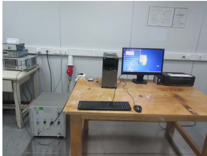
Radiated Emission (30MHz-1GHz) Connect to PC