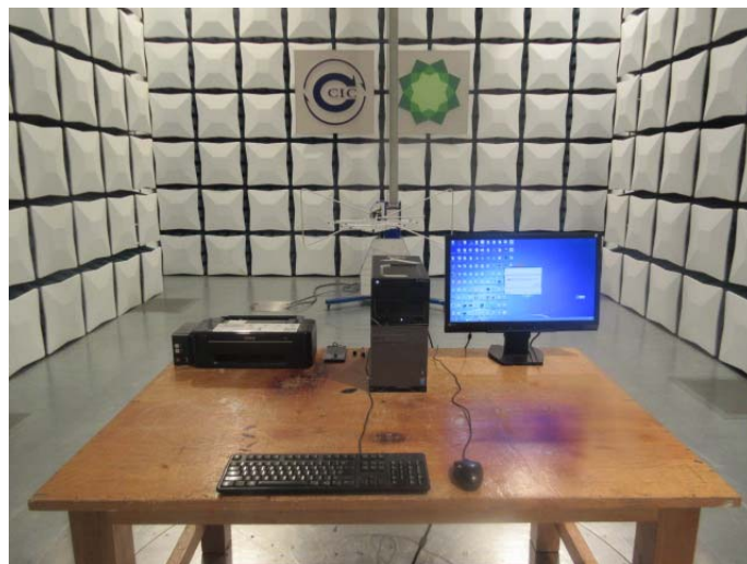
Radiated Emission (above 1GHz) Connect to PC