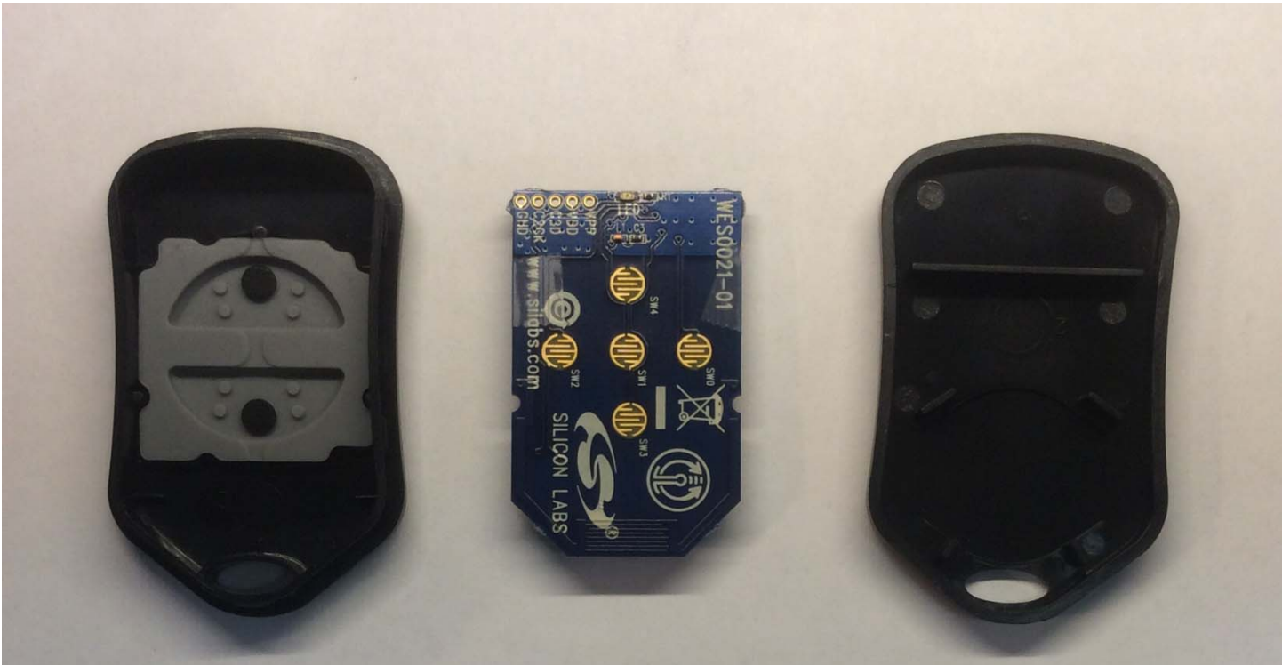
Figure 2: Internal Photo with Back PCB View