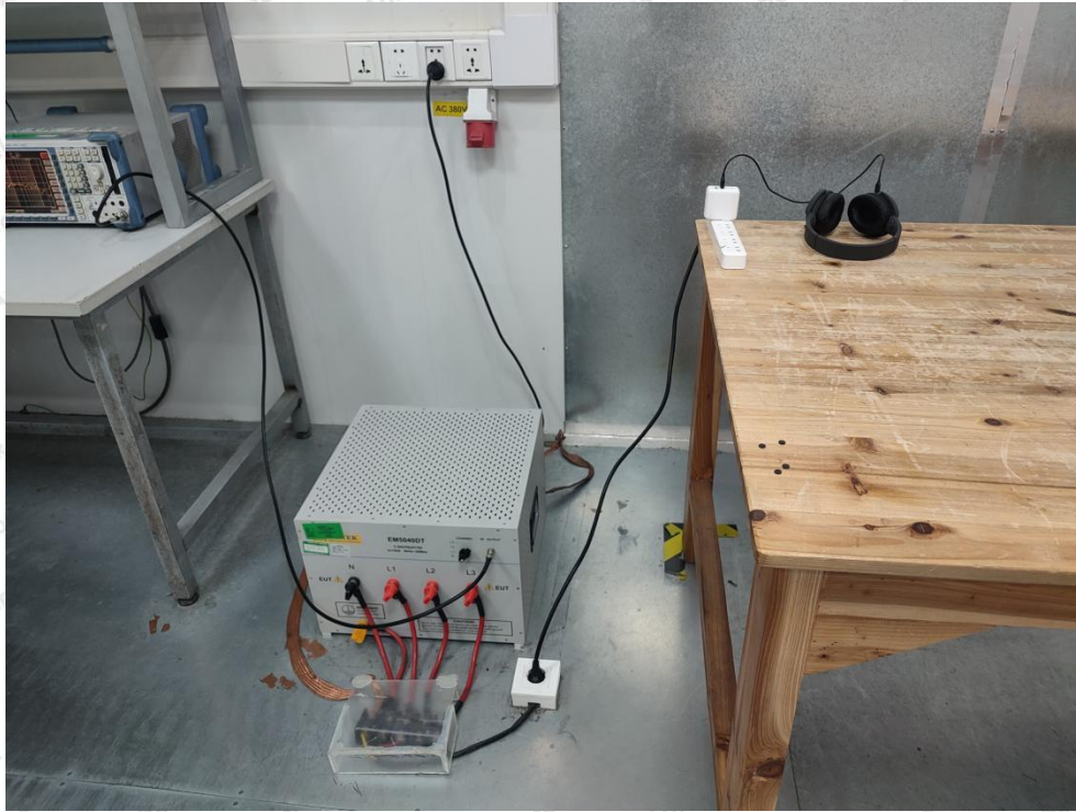
Photo of Radiation Emission Test