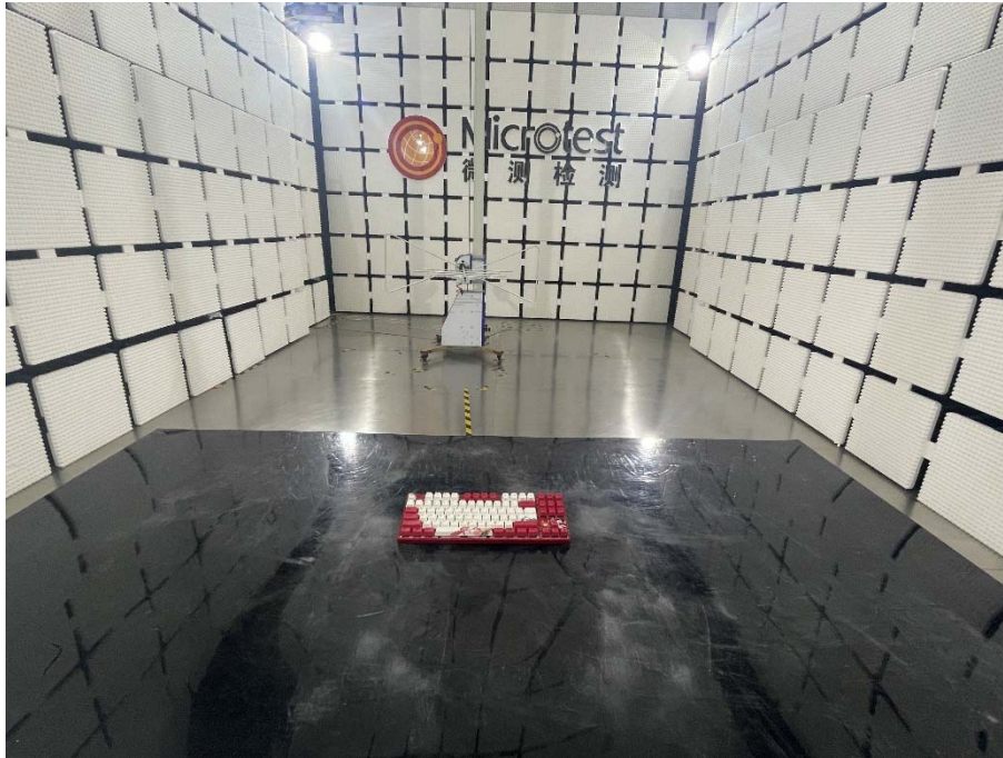
Radiated emissions –Above 1 GHz