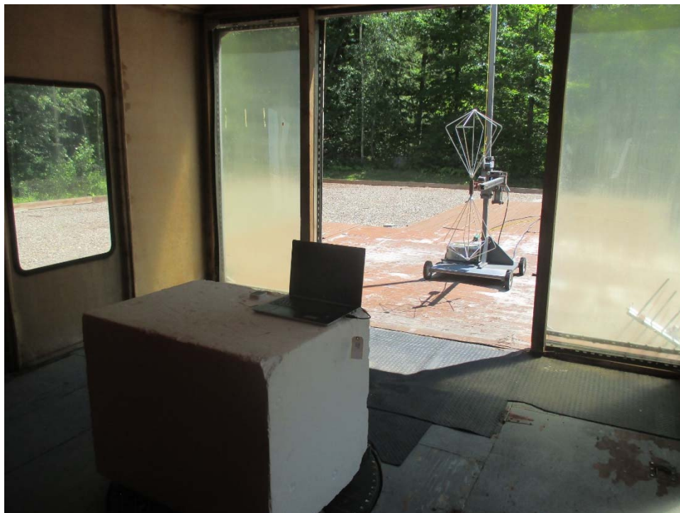
Vertical Antenna Polarization, 30 to 200 MHz