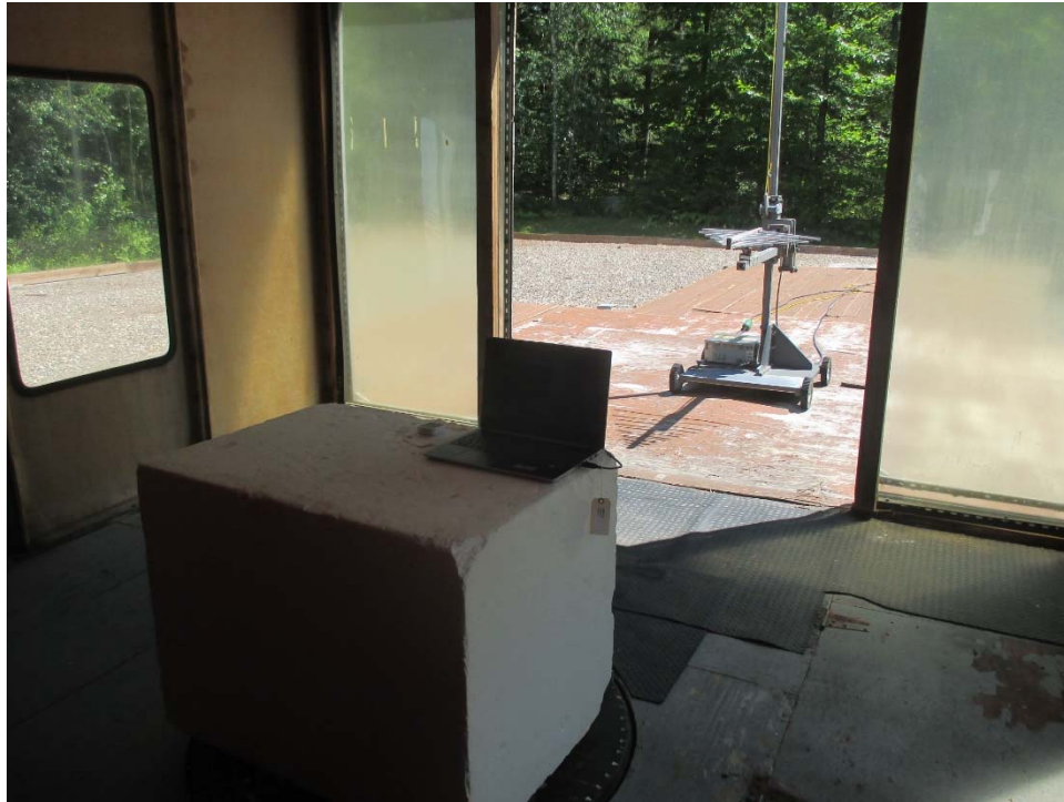
Horizontal Antenna Polarization, 200 MHz to 1 GHz