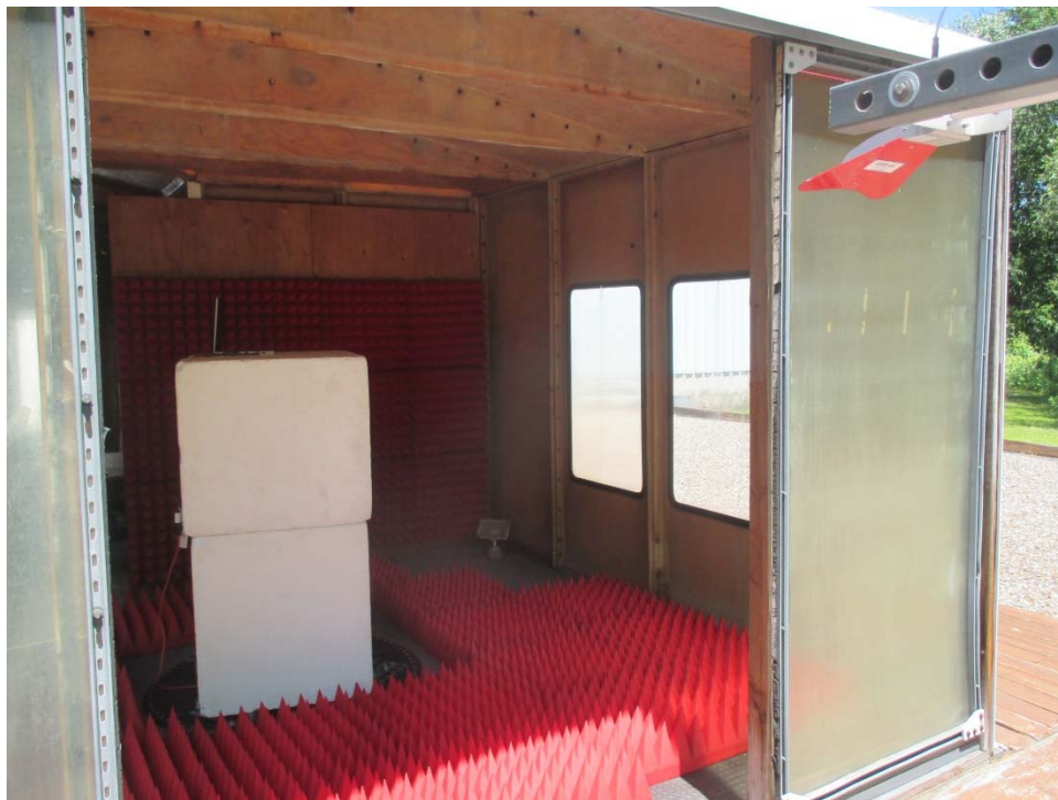
Vertical Antenna Polarization, 1 GHz to 10 GHz