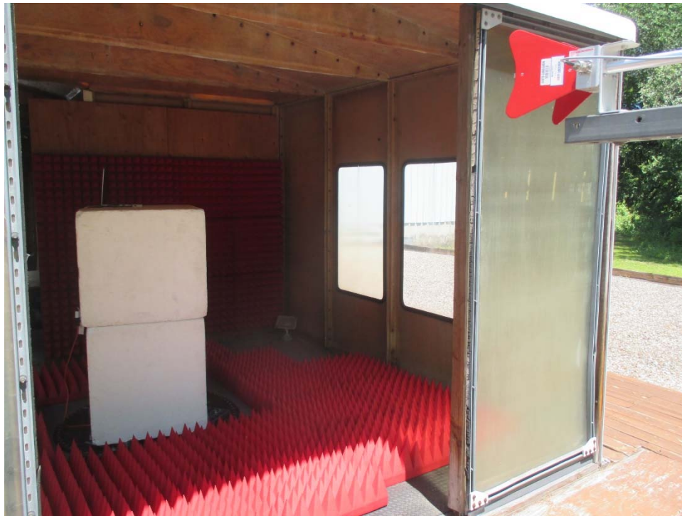
Horizontal Antenna Polarization, 1 GHz to 10 GHz