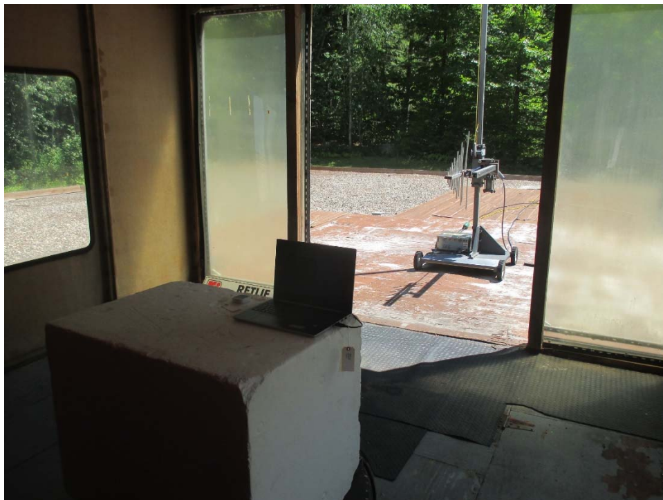
Vertical Antenna Polarization, 200 MHz to 1 GHz